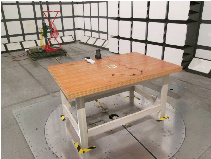
Radiated Emissions – Rear View (30-1000 MHz)