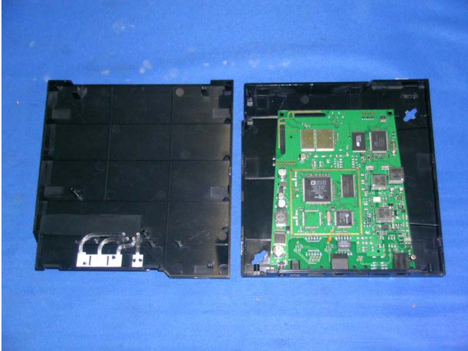
VoIP and PSTN Gateway Main PCB comp side