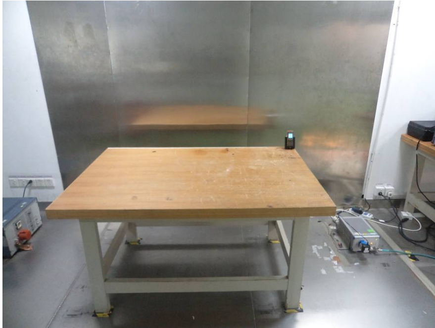
AC Line Conducted Emissions – Side View