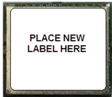
WLAN RADIO TOP