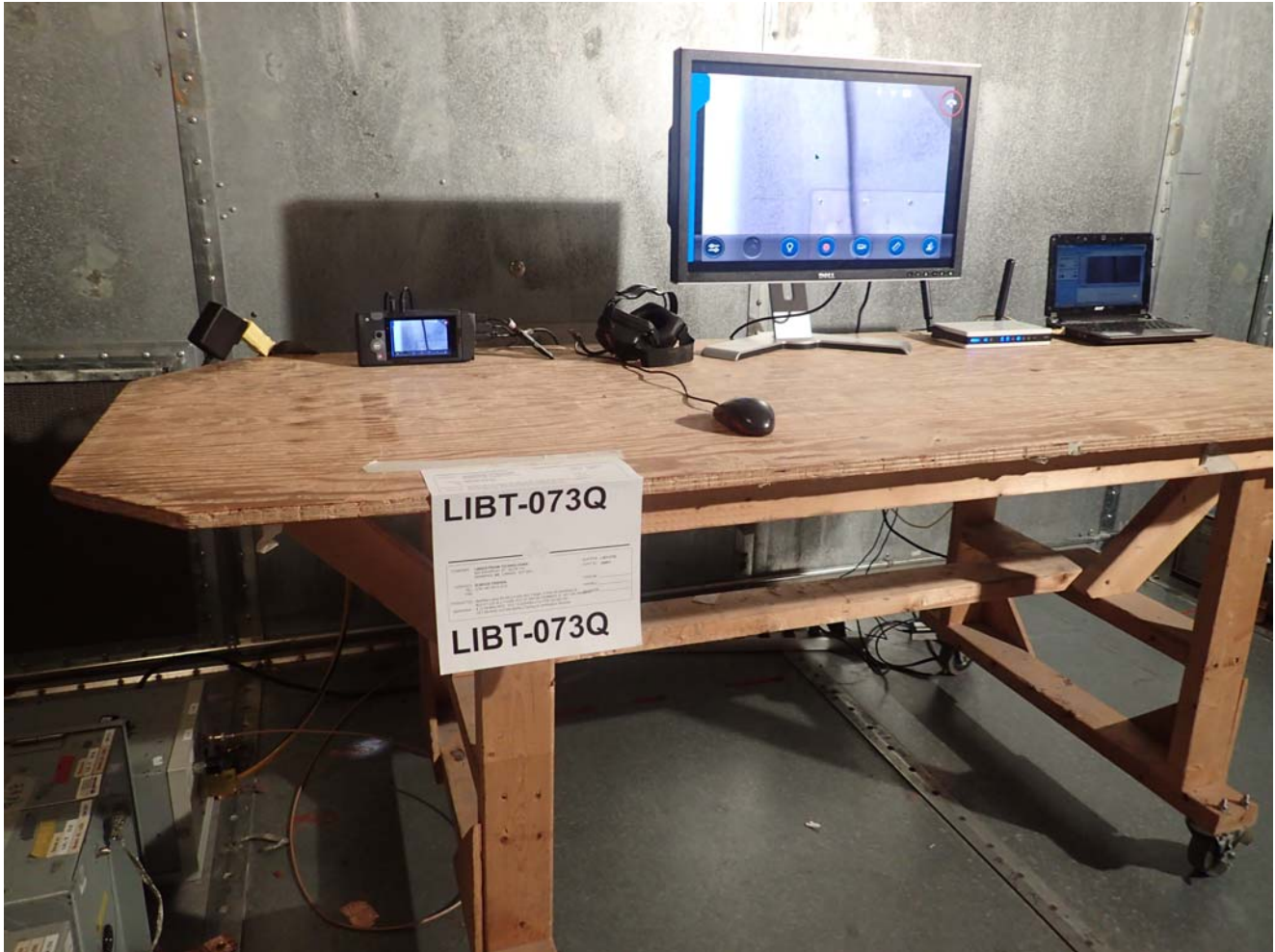
Power Line Conducted Emission (without aluminum shield)