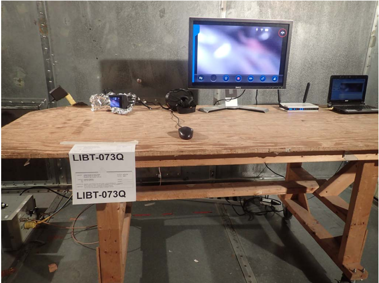
Power Line Conducted Emission (with aluminum shield)