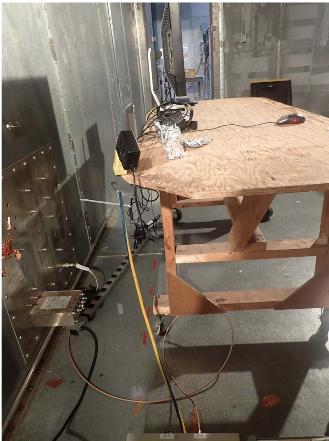
Power Line Conducted Emission (with aluminum shield)

Librestream Technologies Inc. Onsight Rugged Smart Camera, Model 5000HD FCC ID: T78-5000HD