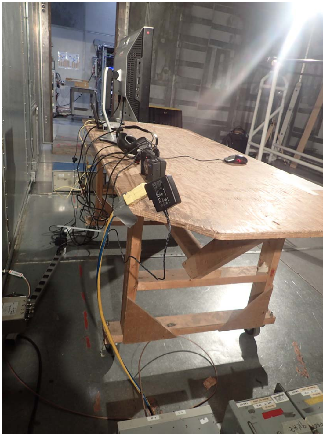
Power Line Conducted Emission (without aluminum shield)

Librestream Technologies Inc. Onsight Rugged Smart Camera, Model 5000HD FCC ID: T78-5000HD