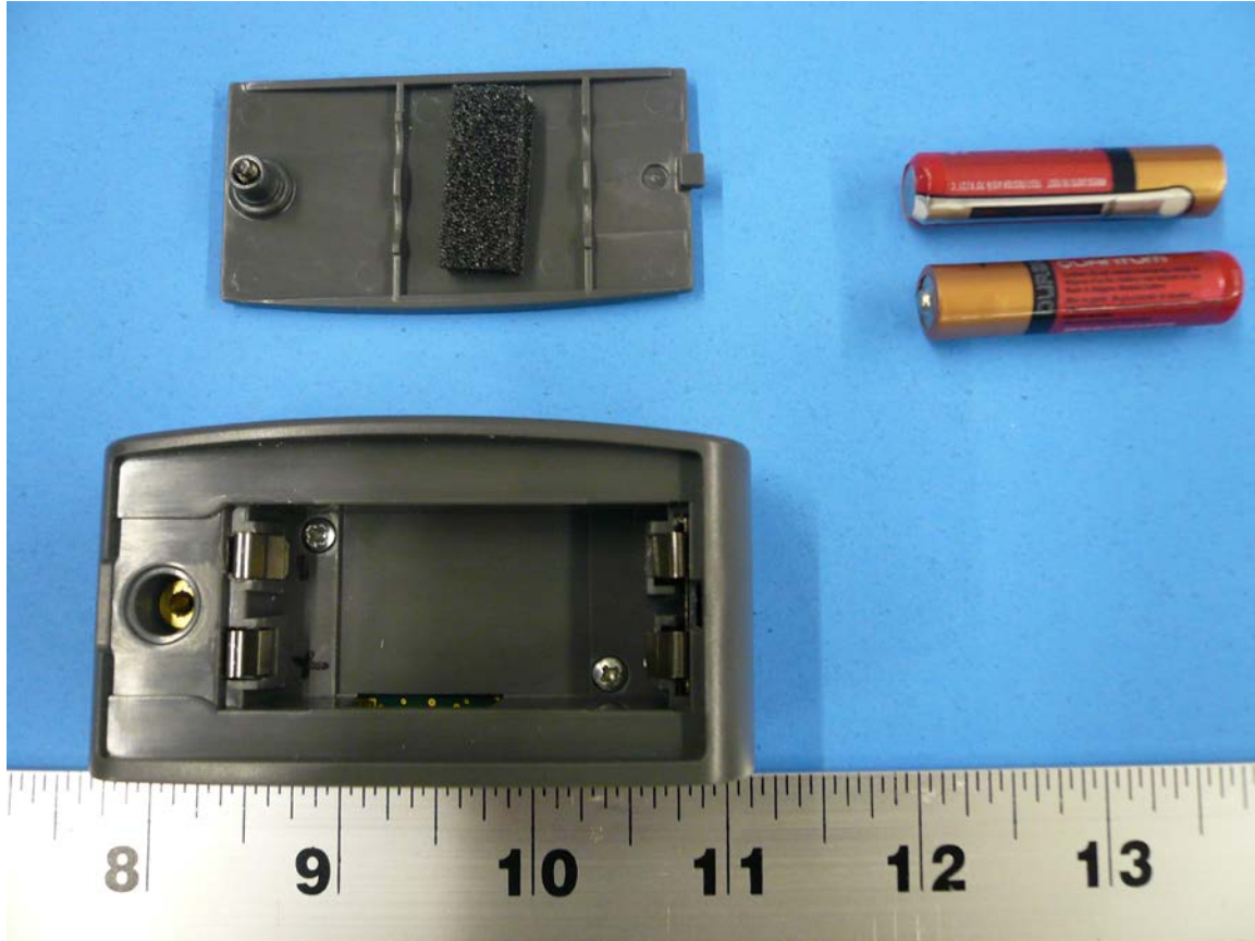
Figure 3: ir3000 FC Battery Compartment.