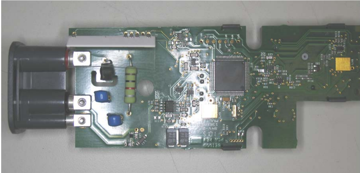
Figure 3: Top View of PCB.