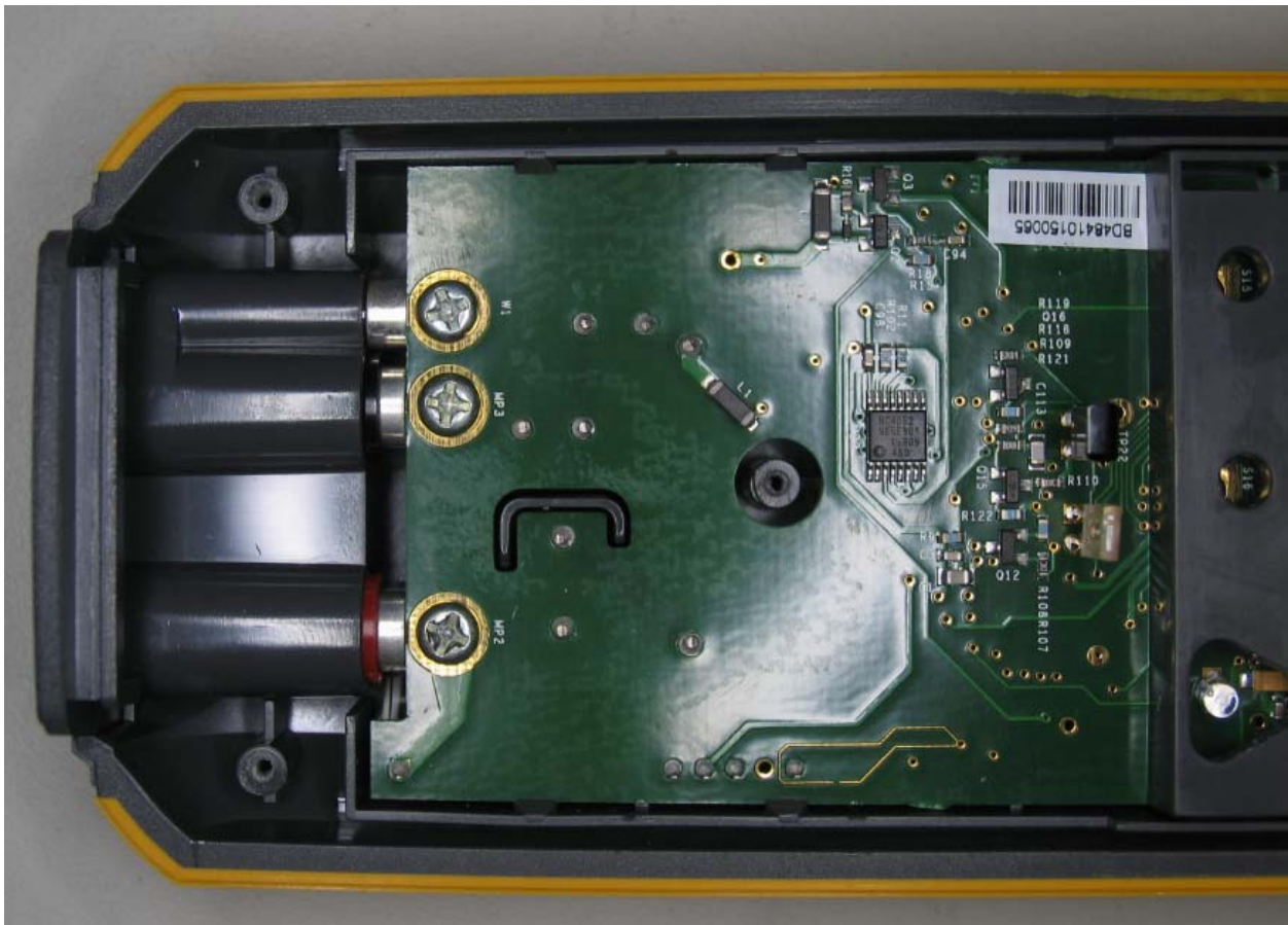
Figure 2: Internal View.