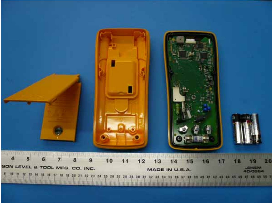
Figure 3: DMM3000 FC - Parts