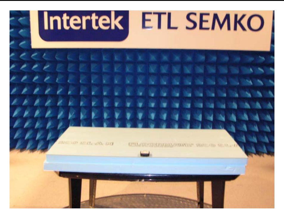
Radiated spurious emission 30-1000 MHz