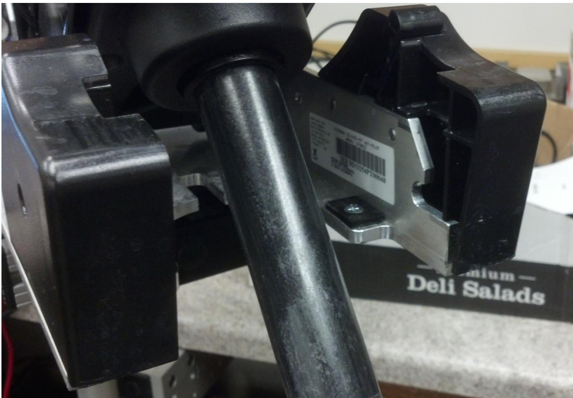
Figure 2 - Label Placement

The label is permanently affixed using a water and wear resistant vinyl label.