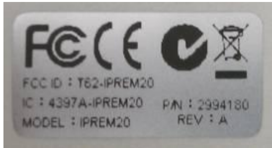
Figure 1 - FCC ID/IC Label