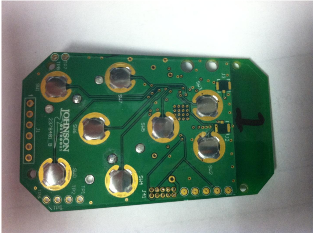
Figure 3 - Front side of PCB

Applicant: Johnson Outdoors Model Name: MICRO REMOTE (iPilot Micro Remote)