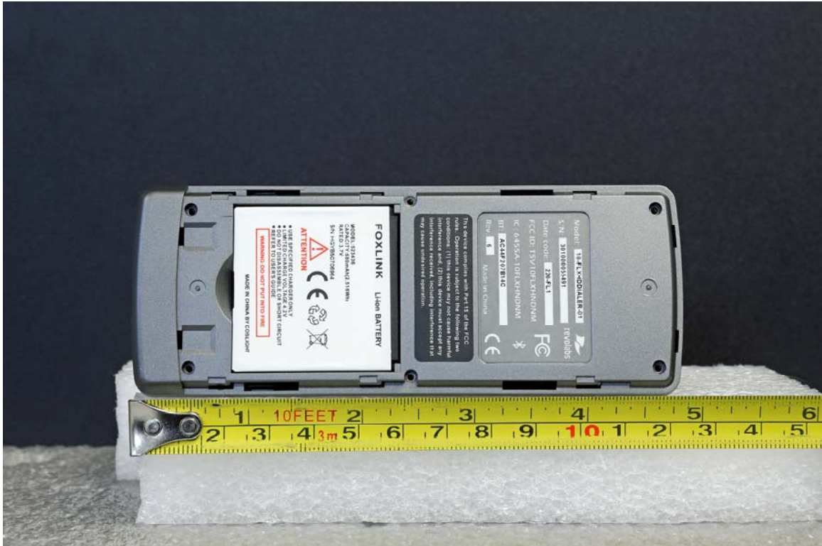
Back Battery Removed