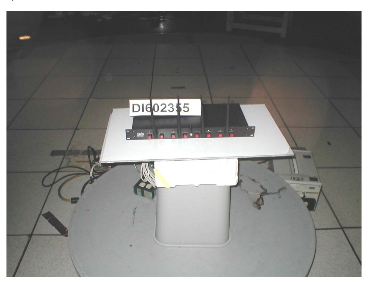
Test Set-up Spurious emissions – FCC Part 15.309