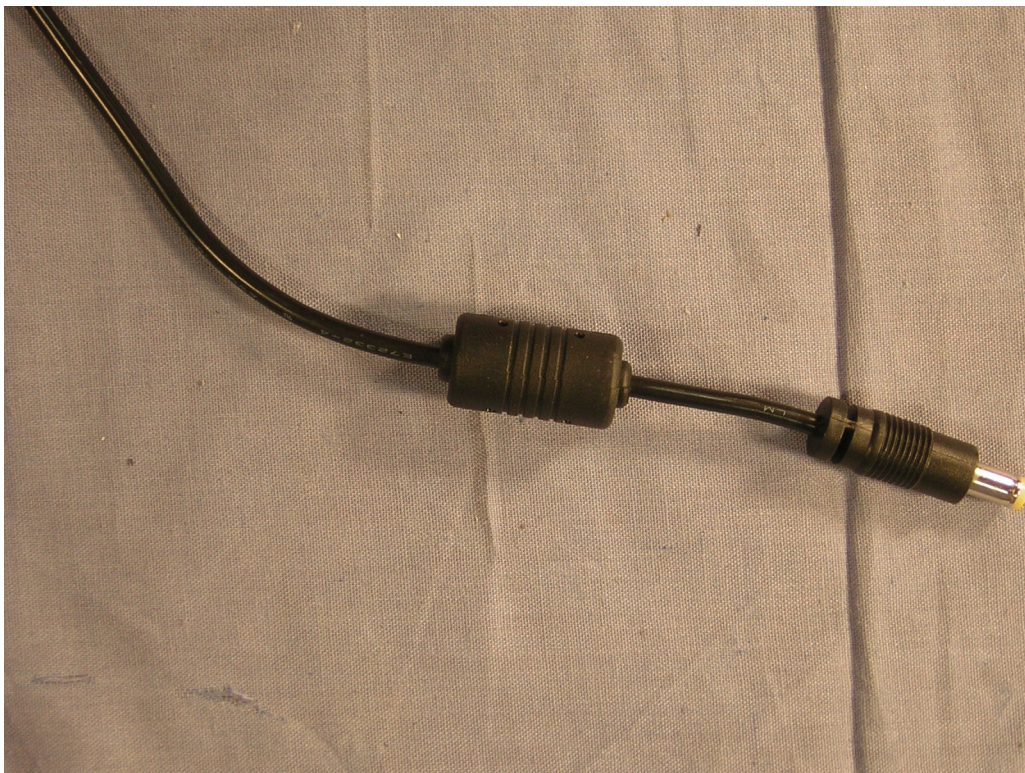
Molded ferrite on AC Adaptor cable