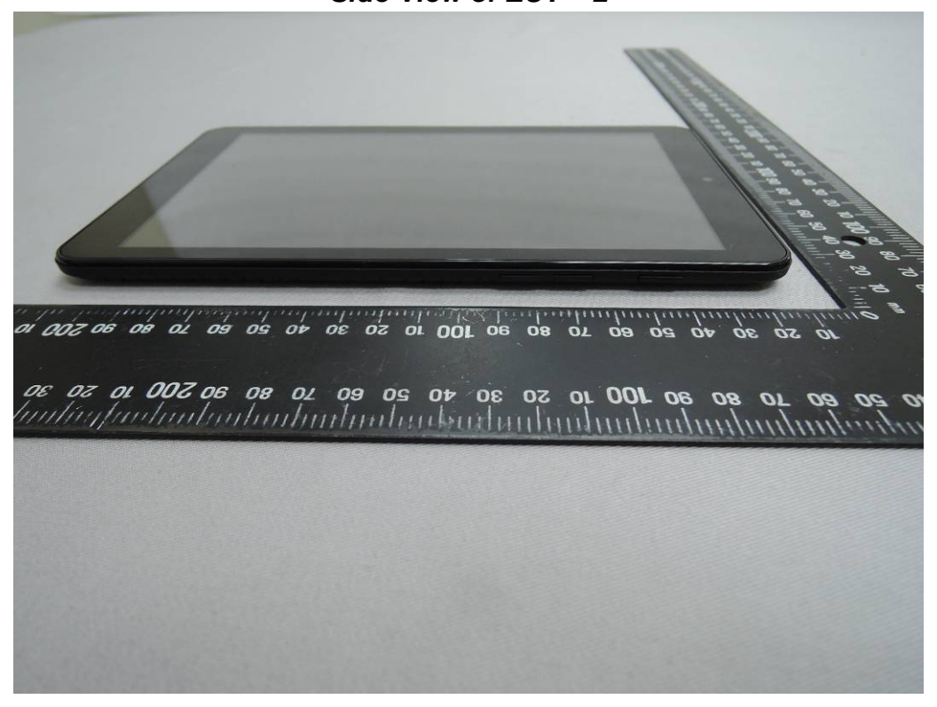
Side View of EUT - 3