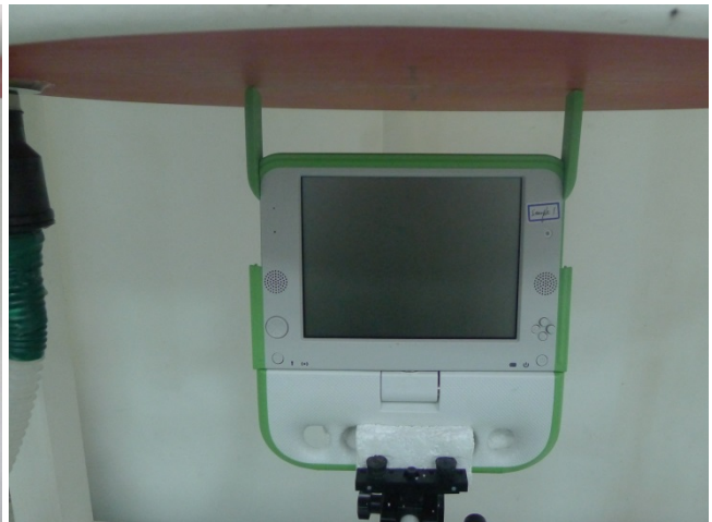
Edge1 with Phantom 0 cm – Antenna Position 180°