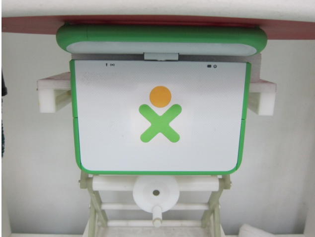
Bottom of Laptop with Phantom 0 cm Gap – Antenna Position 0°