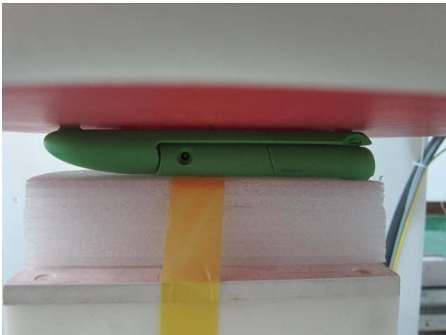
Bottom of Tablet with Phantom 0 cm – Antenna Position 0°