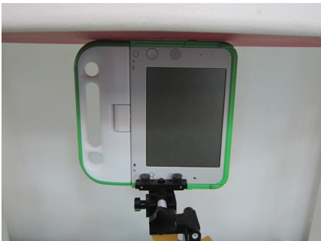
Edge4 with Phantom 0 cm – Antenna Position 0°