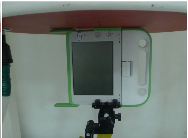
Edge2 with Phantom 0 cm – Antenna Position 180°