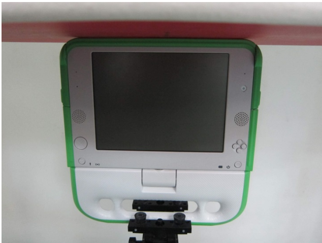
Edge1 with Phantom 0 cm – Antenna Position 0°