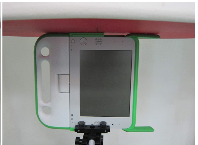
Edge4 with Phantom 0 cm – Antenna Position 180°