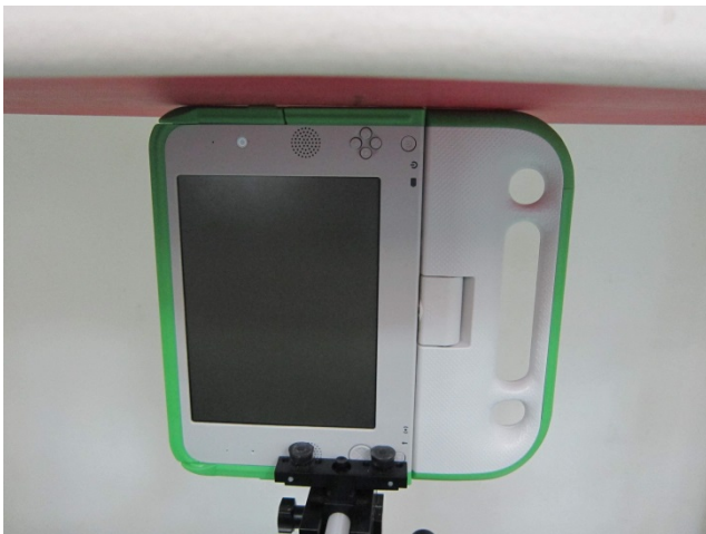
Edge2 with Phantom 0 cm – Antenna Position 0°