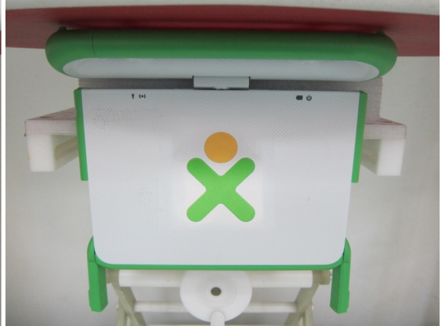
Bottom of Laptop with Phantom 0 cm Gap – Antenna Position 180°