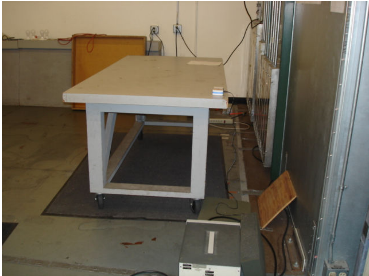
Remote, Conducted emission 2(15.107 / 15.207)