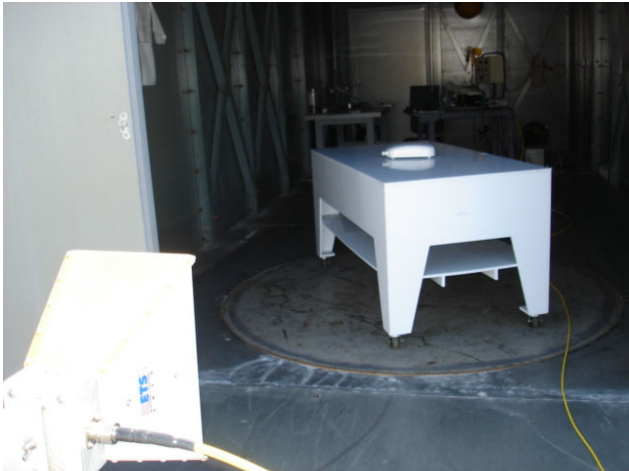
Detector, Radiated Emission (15.247 / 15.109)