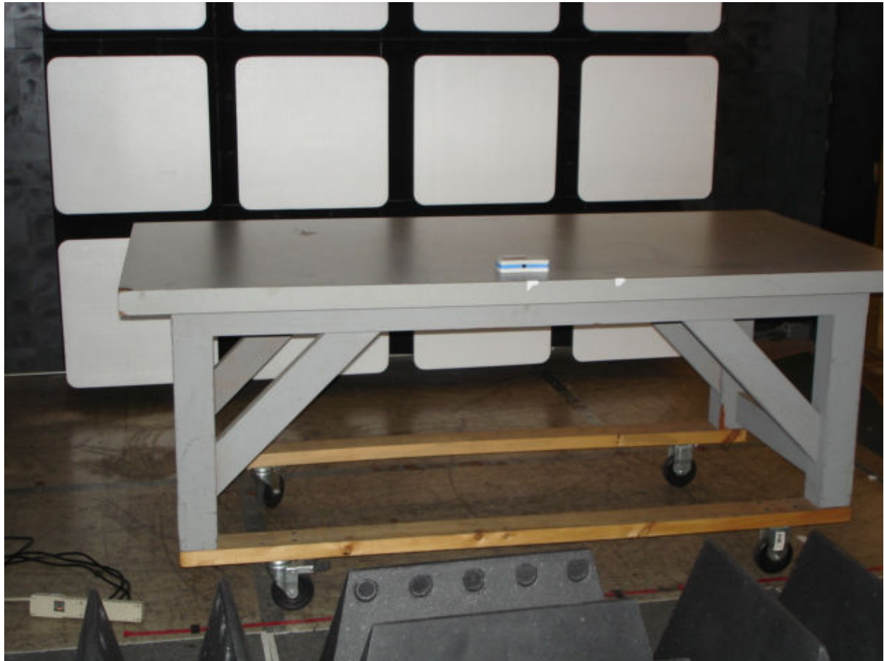
Remote, Radiated emission prescan in the chamber