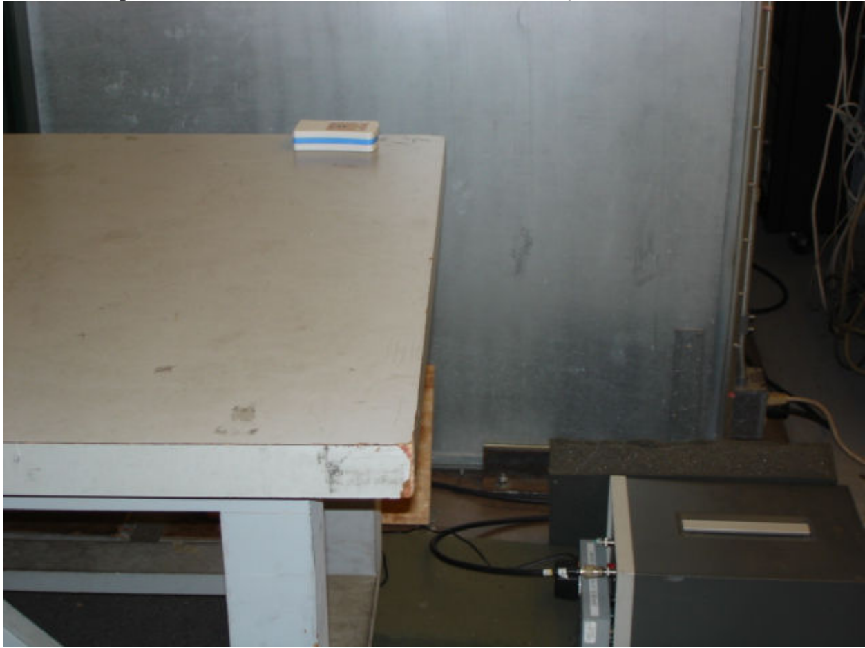
Remote, Conducted emission 1(15.107 / 15.207)