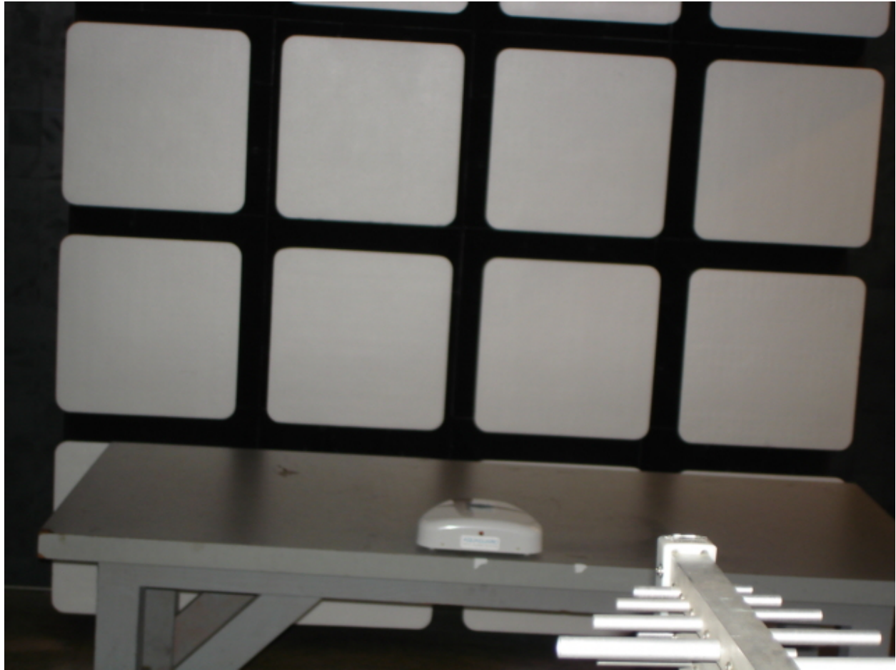
Detector, Radiated emission prescan in the chamber