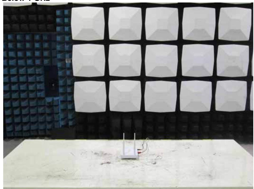
Below 1 GHz