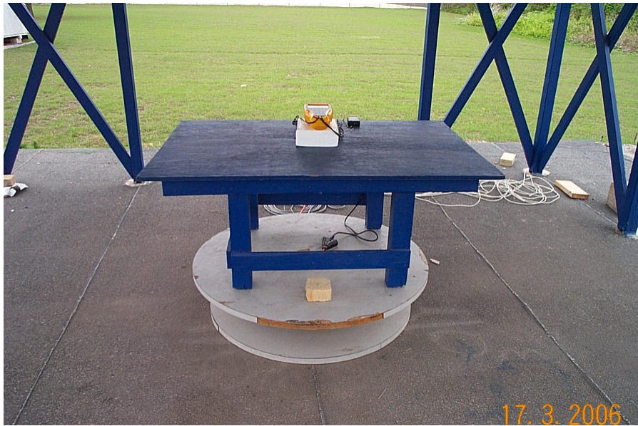
Figure 4, Spurious Radiated < 1 GHz, Front