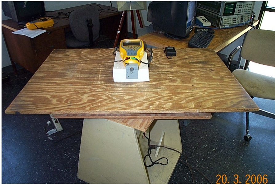
Figure 2, Spurious/Harmonics/Power/Bandwidth... > 1 GHz, Front The balun clamp visible at the front is used to hold the EUT upright.