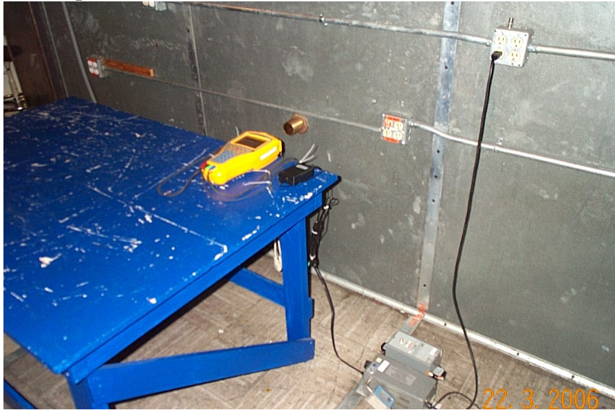
Figure 5, Mains Conducted, Table