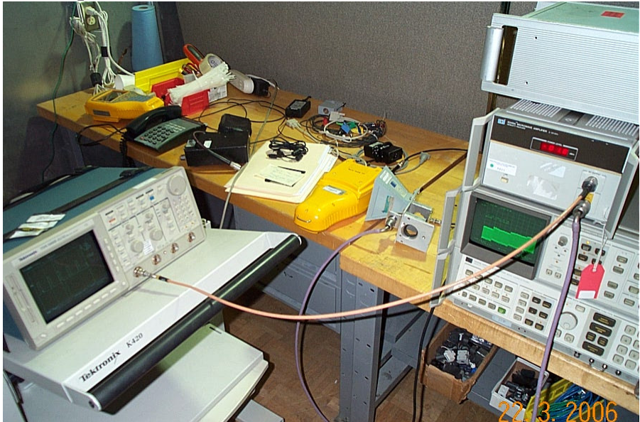
Figure 7, Timing/Dwell