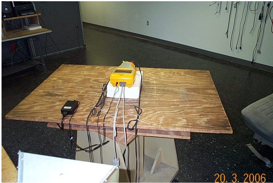
Figure 1, Spurious/Harmonics/Power/Bandwidth... > 1 GHz, Cables