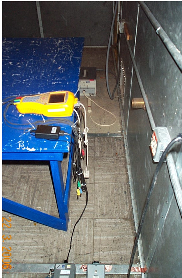
Figure 6, Mains Conducted, Cables