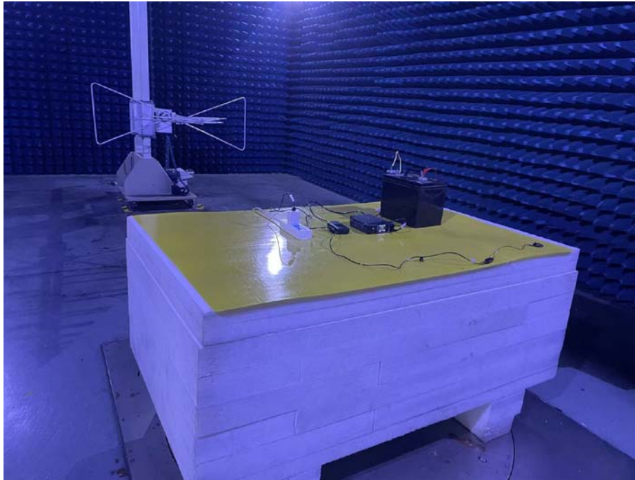
Photo of Radiated Emission Measurement Above 1GHz