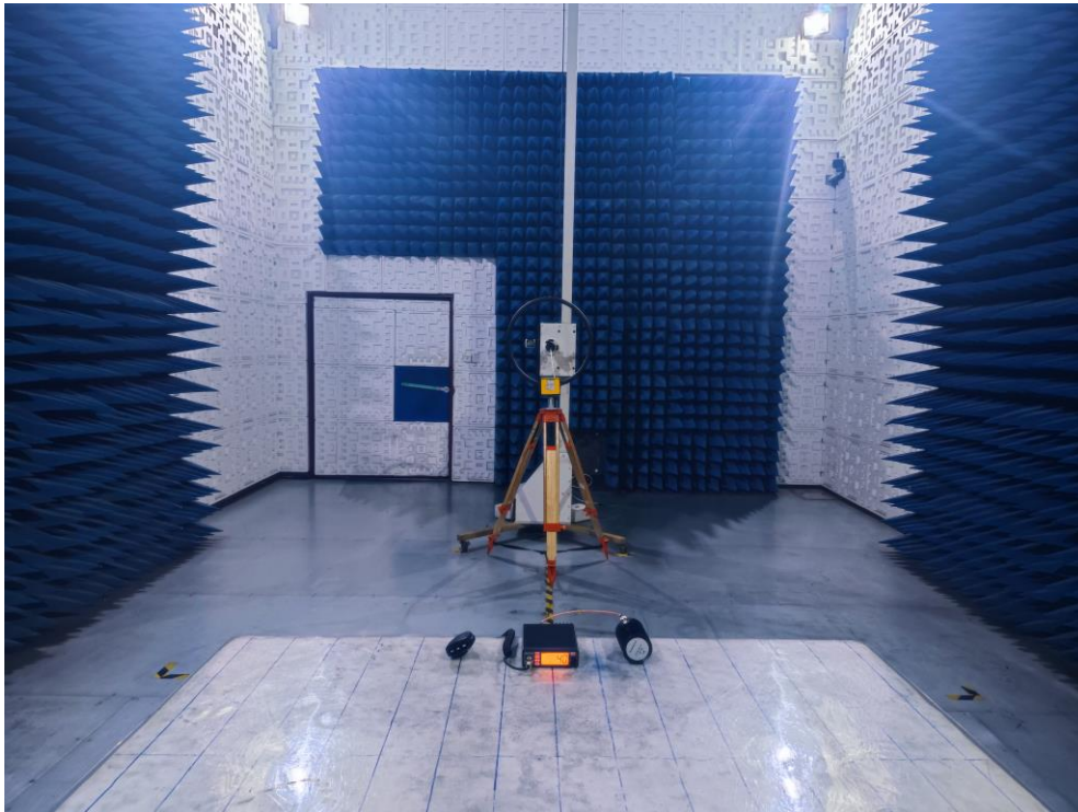
RADIATED EMISSION TEST SETUP-ABOVE 30MHz