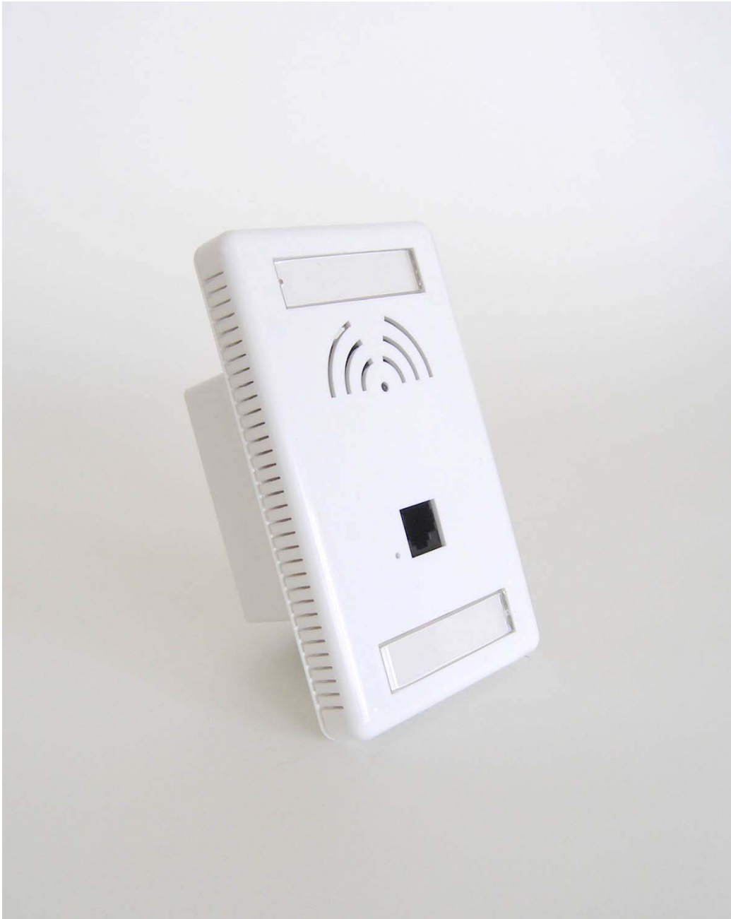
Figure 1 – Overall front view of the EUT