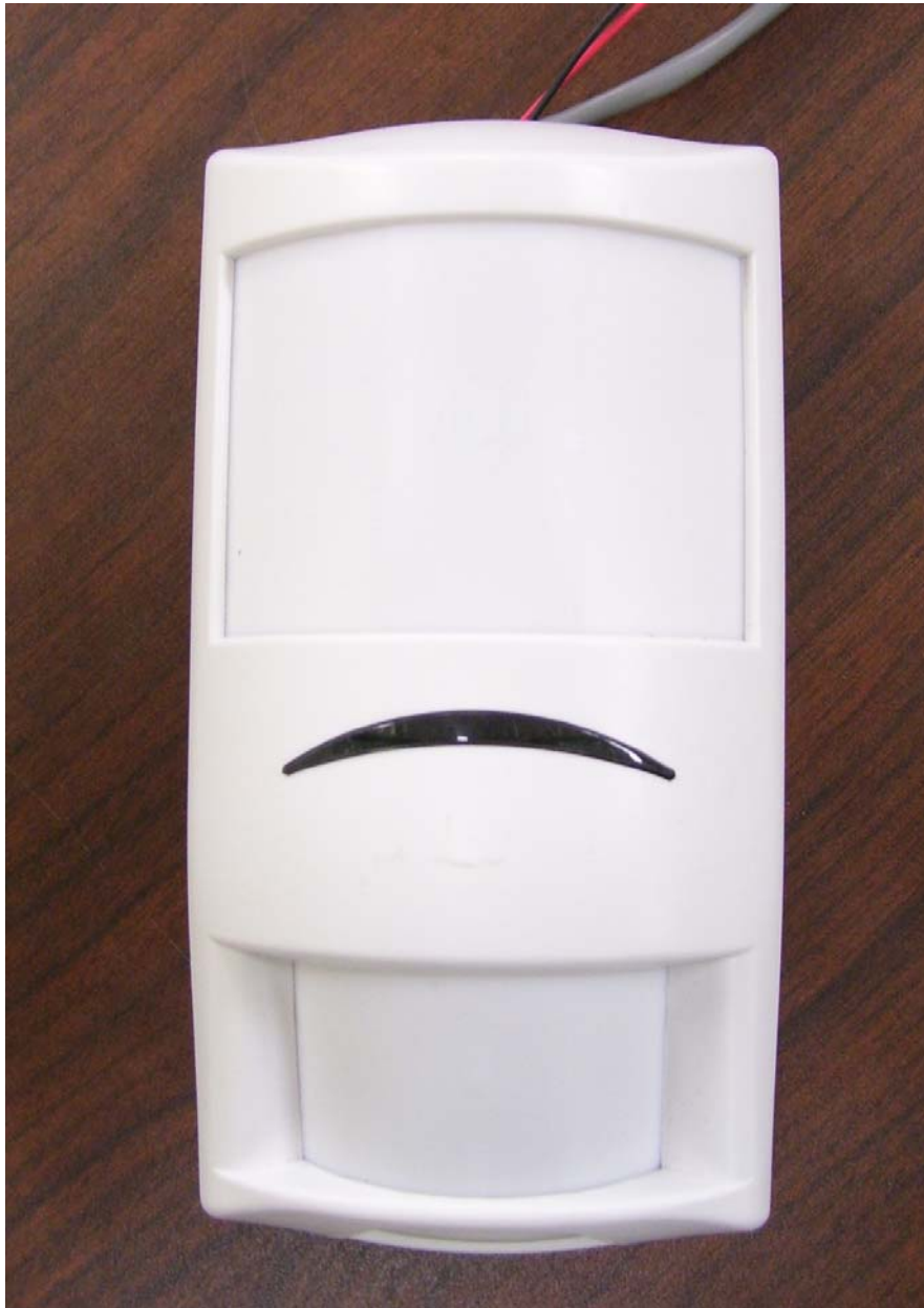
Figure 1: External View – Front of Sensor