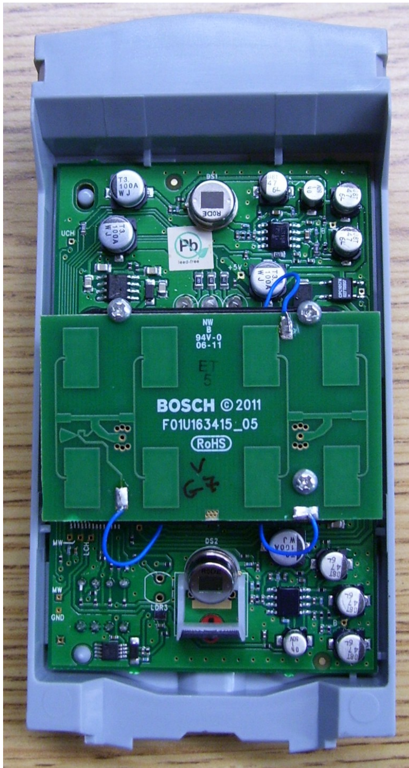
Figure 1: Internal View – Front of Sensor