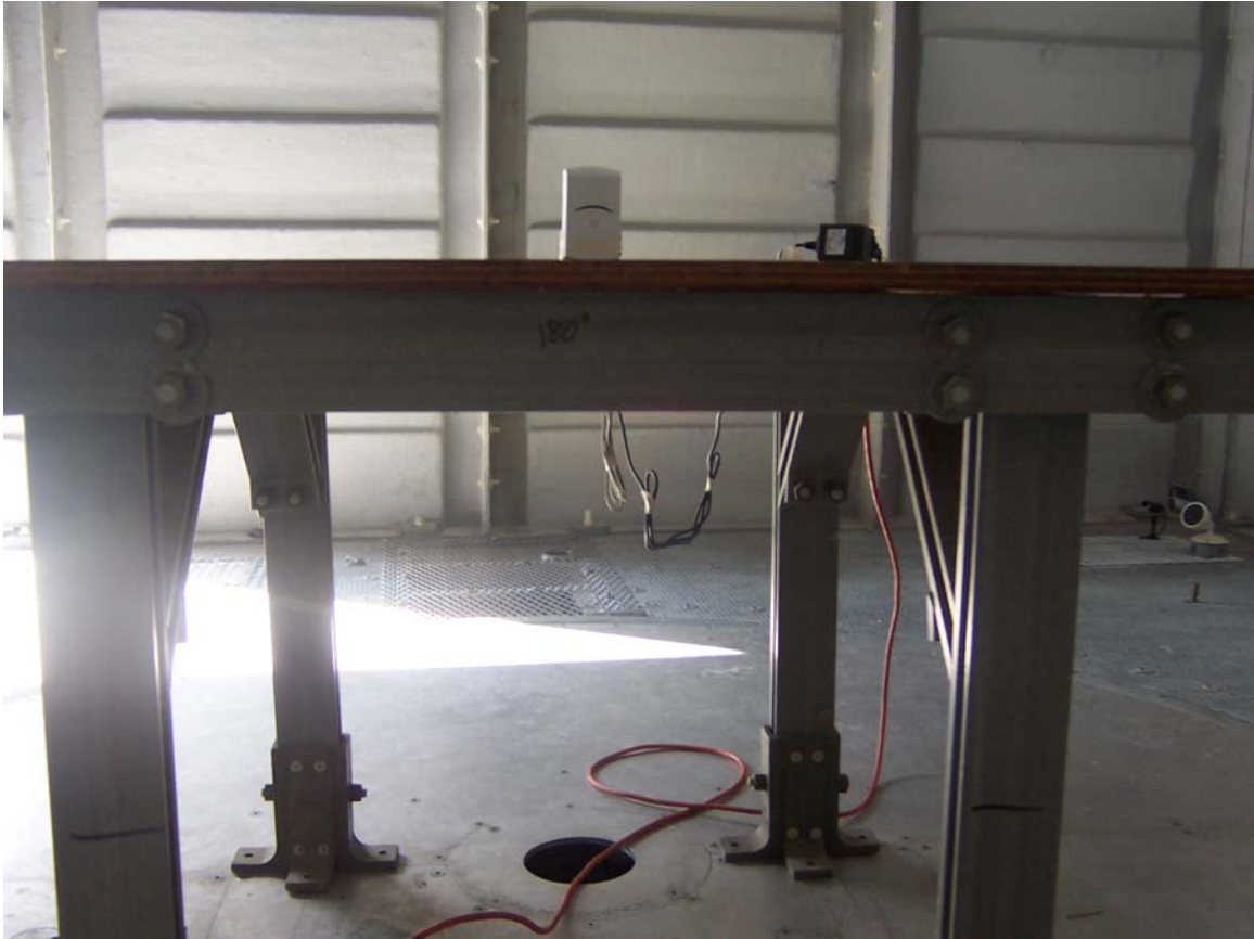
Radiated Emissions Test setup Z-Axis – Front