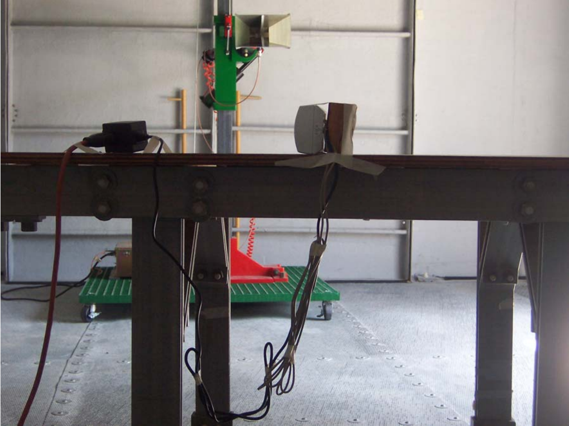
Radiated Emissions Test setup Y-Axis - Back