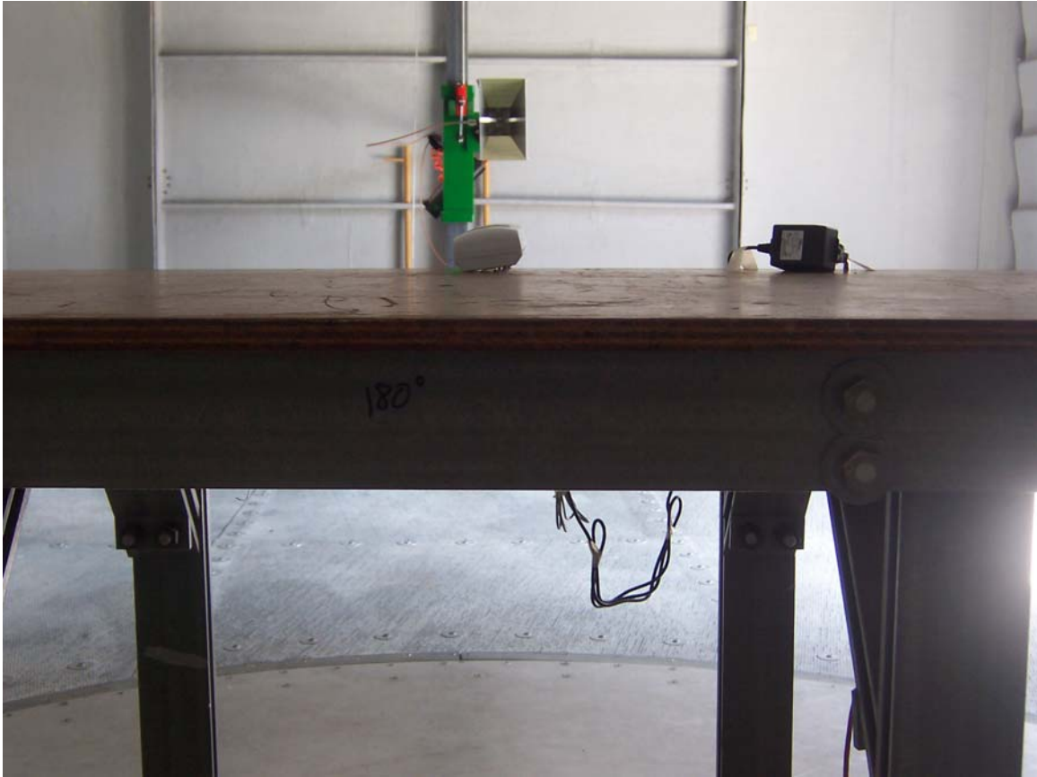
Radiated Emissions Test setup X-Axis - Front