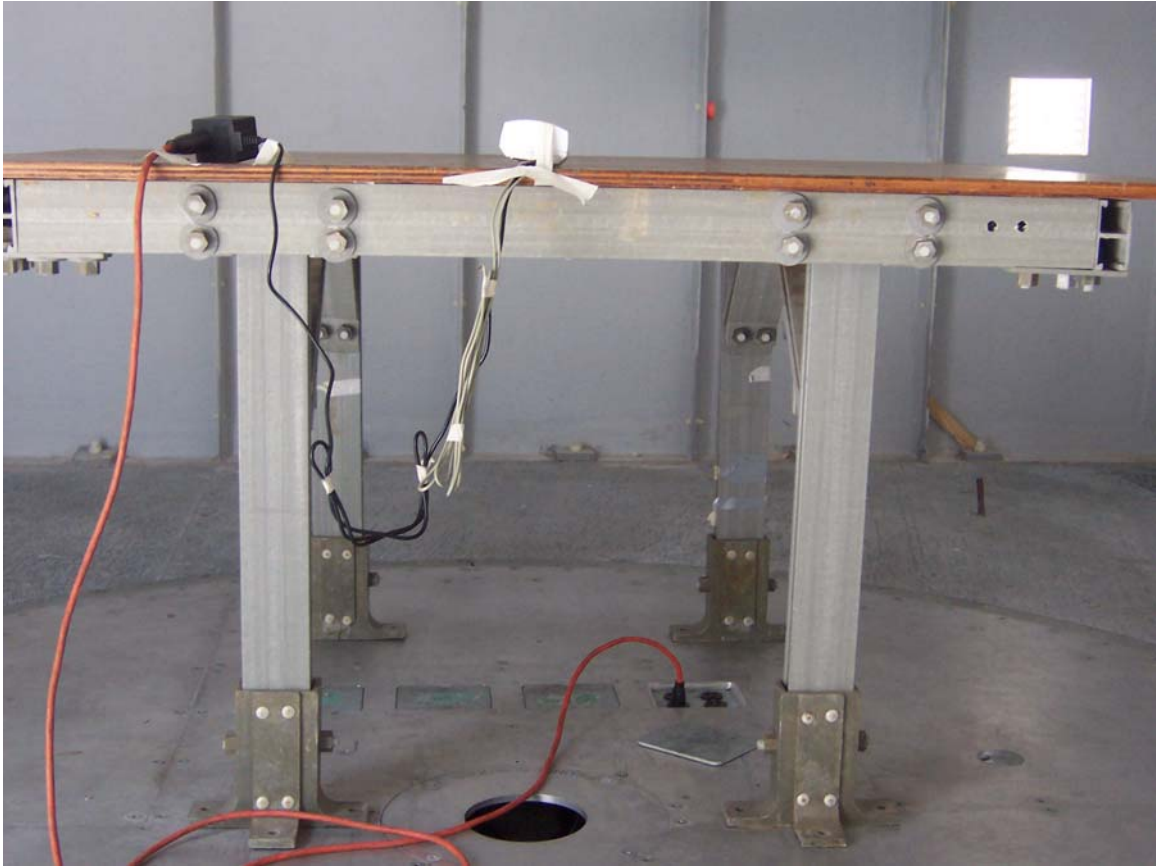
Radiated Emissions Test setup X-Axis - Back