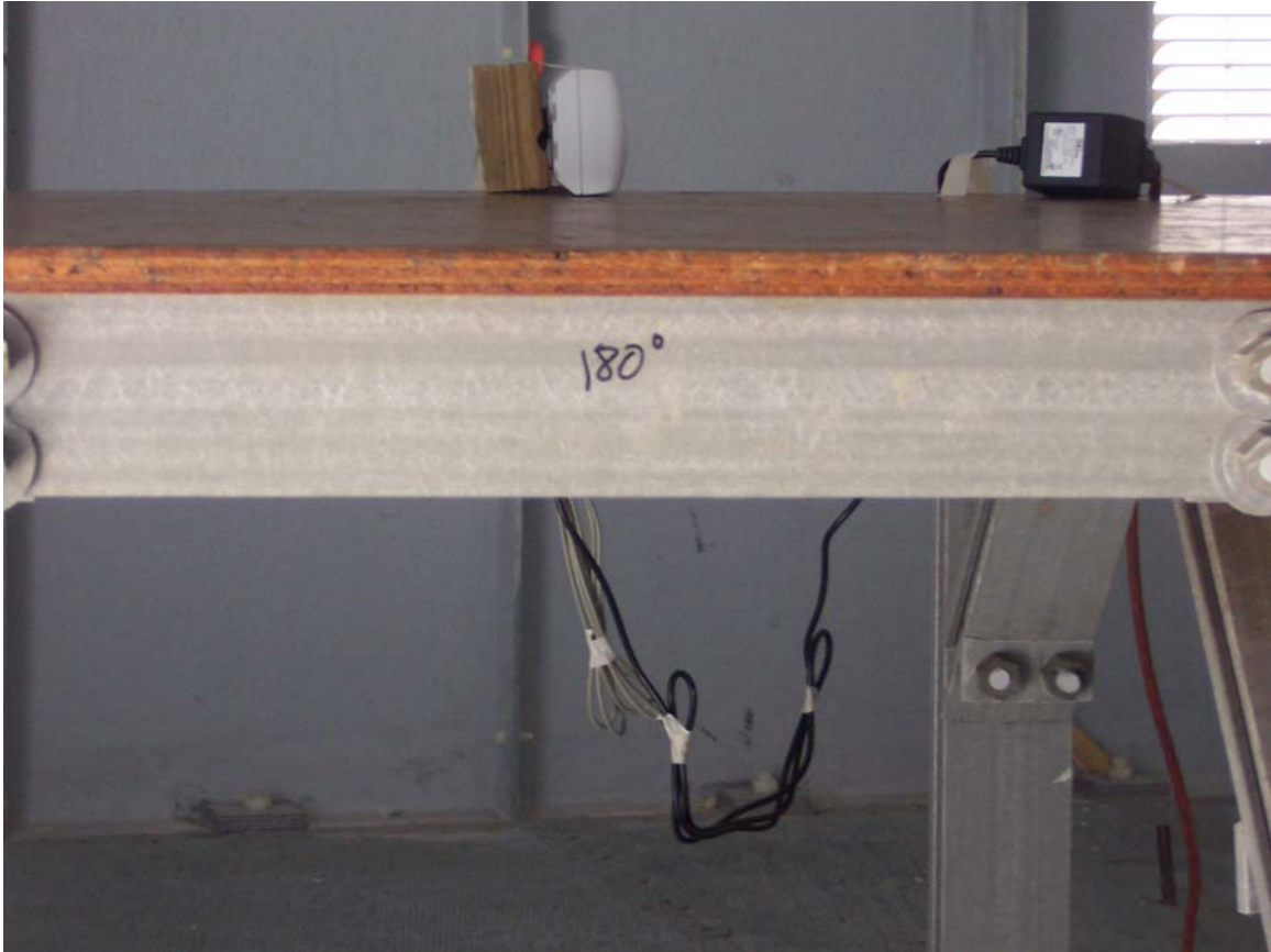
Radiated Emissions Test setup Y-Axis - Front