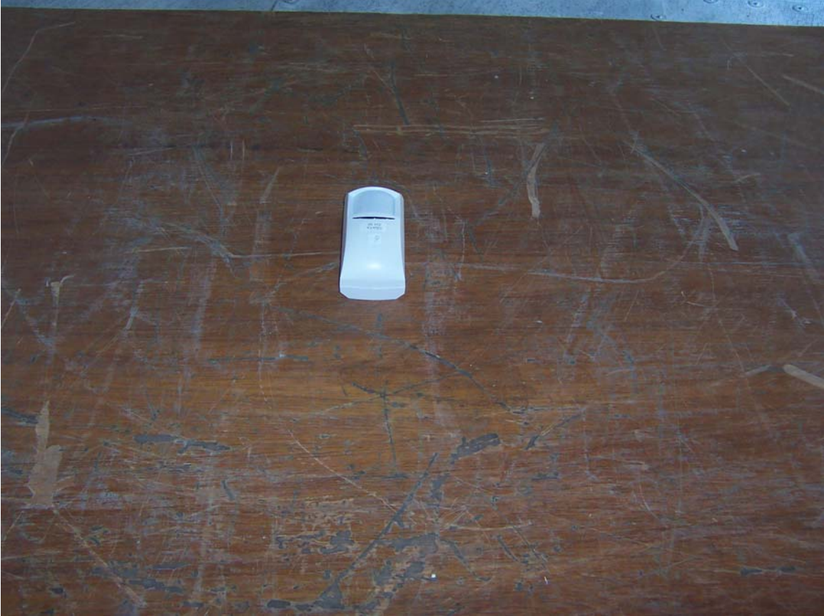
Radiated Emissions Test setup X-Axis