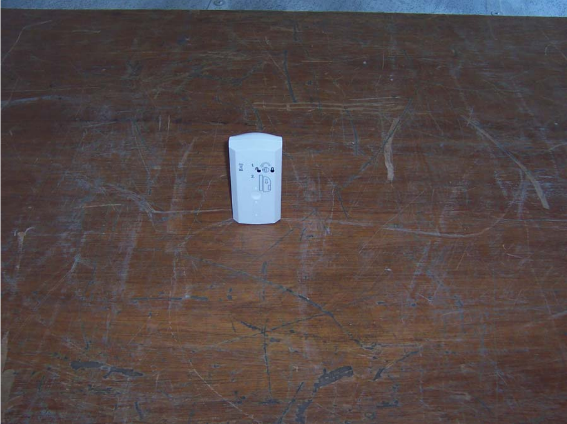
Radiated Emissions Test setup Z-Axis