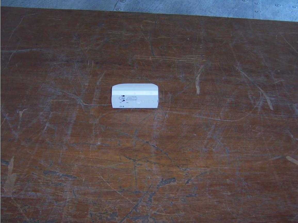
Radiated Emissions Test setup Y-Axis