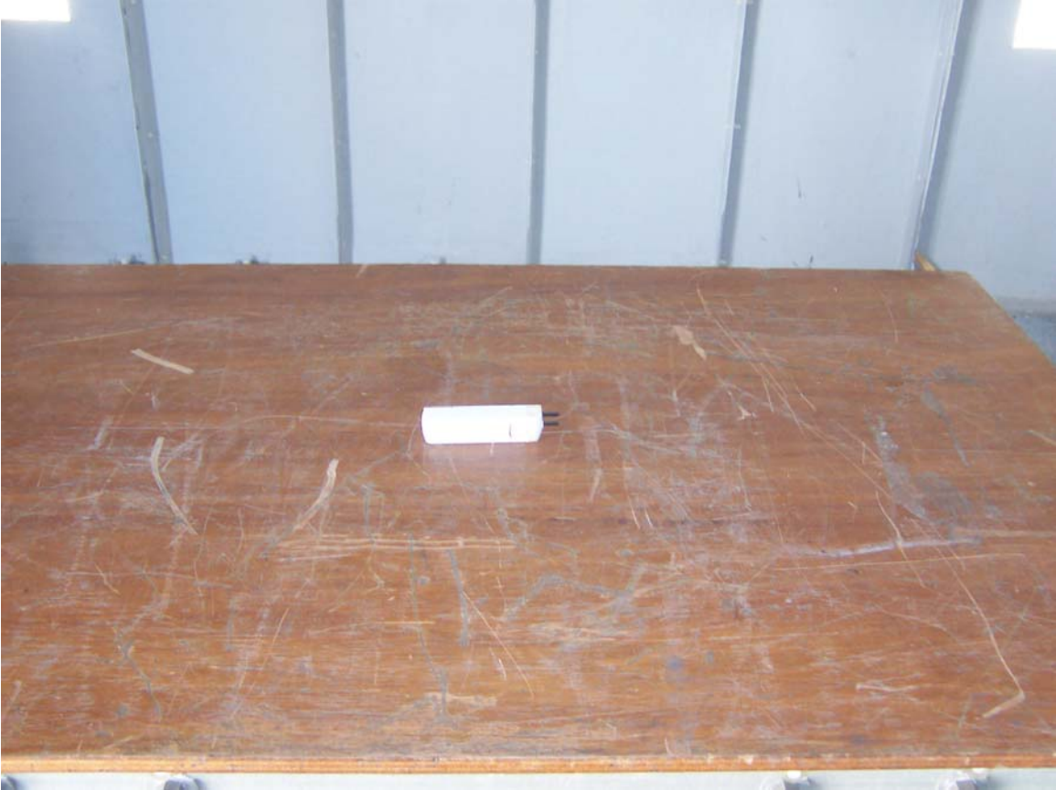
Radiated Emissions Test setup Y-Axis