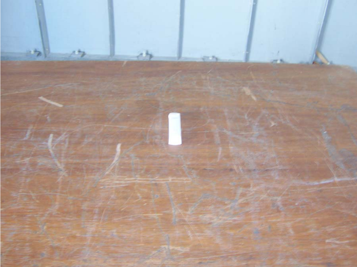
Radiated Emissions Test setup X-Axis