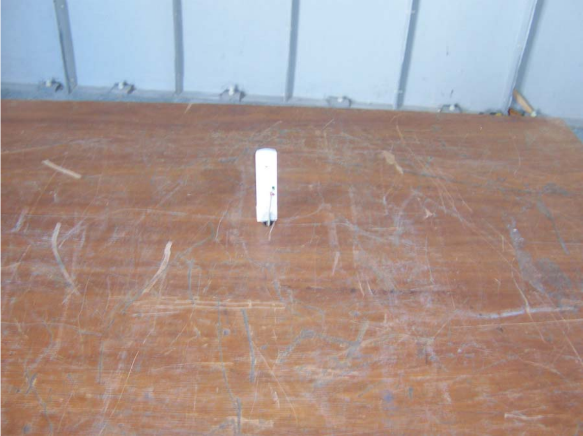
Radiated Emissions Test setup Z-Axis