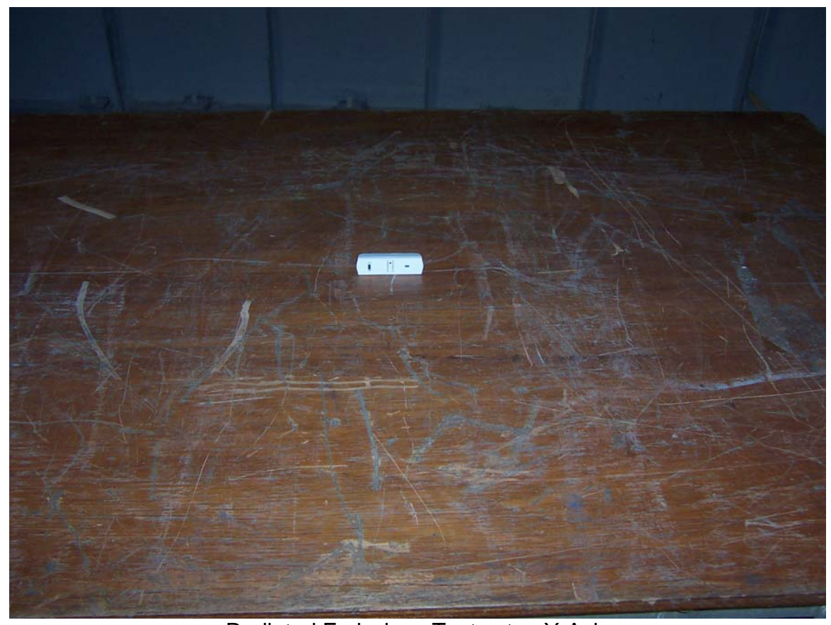
Radiated Emissions Test setup Y-Axis