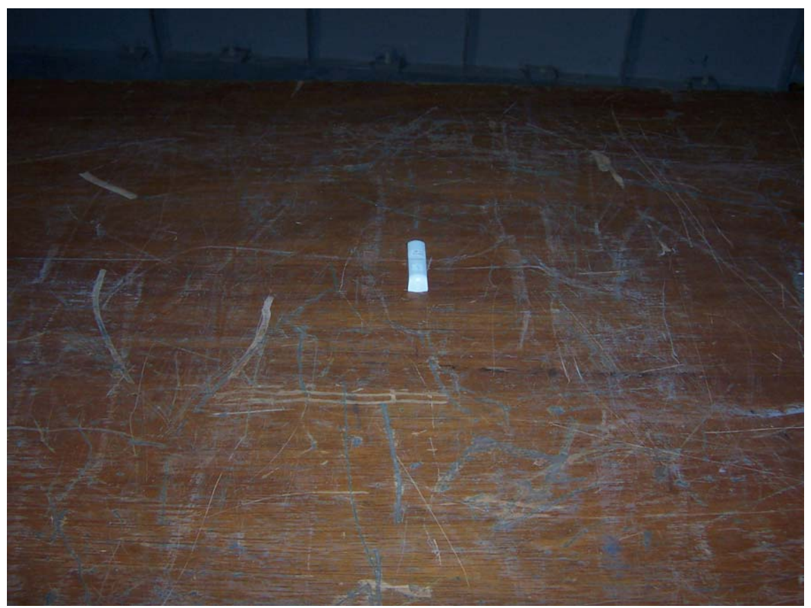
Radiated Emissions Test setup X-Axis