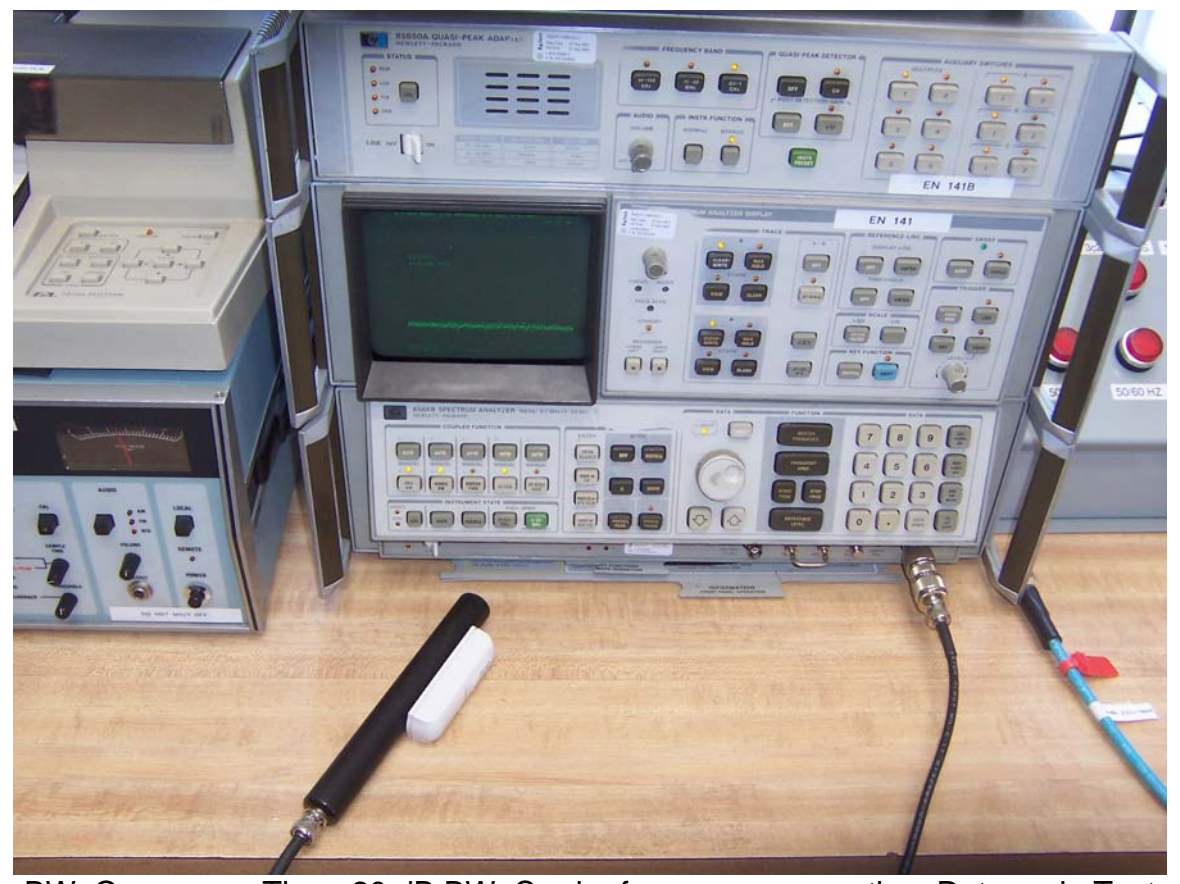
BW, Occupancy Time, 20 dB BW, Carrier frequency separation, Duty cycle Test Setup