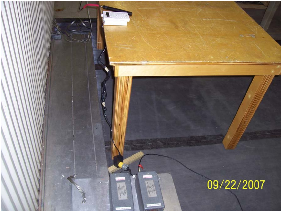
Conducted Emissions Test Setup