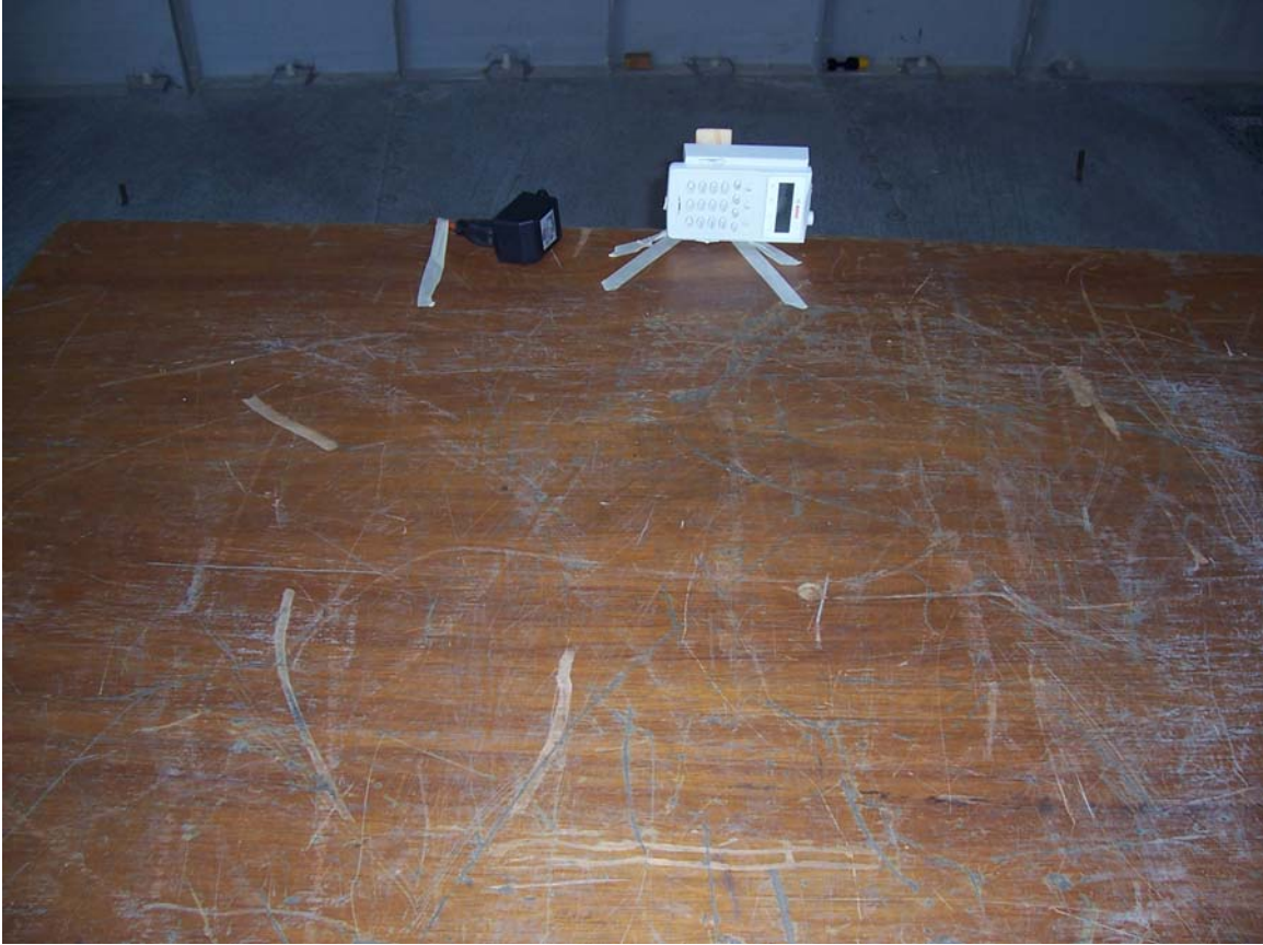
Radiated Emissions Test setup Z-Axis