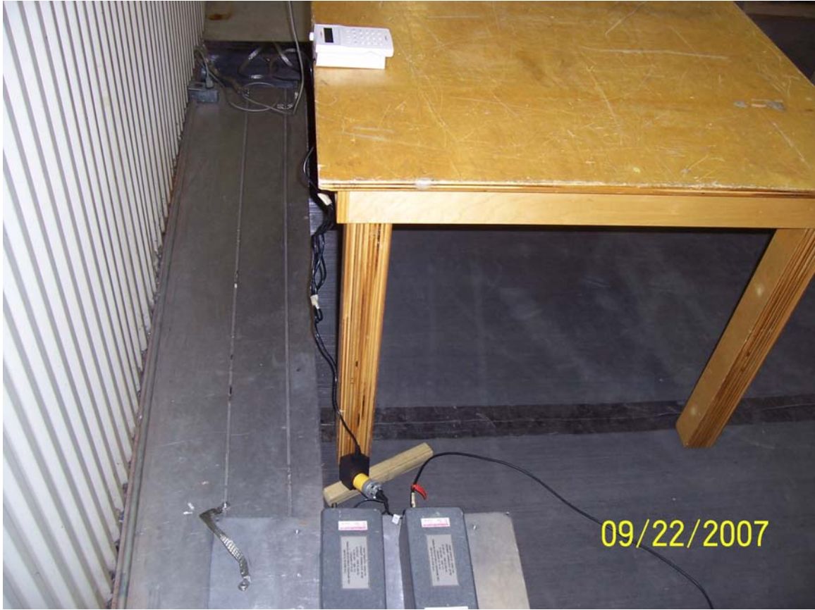
Conducted Emissions Test Setup