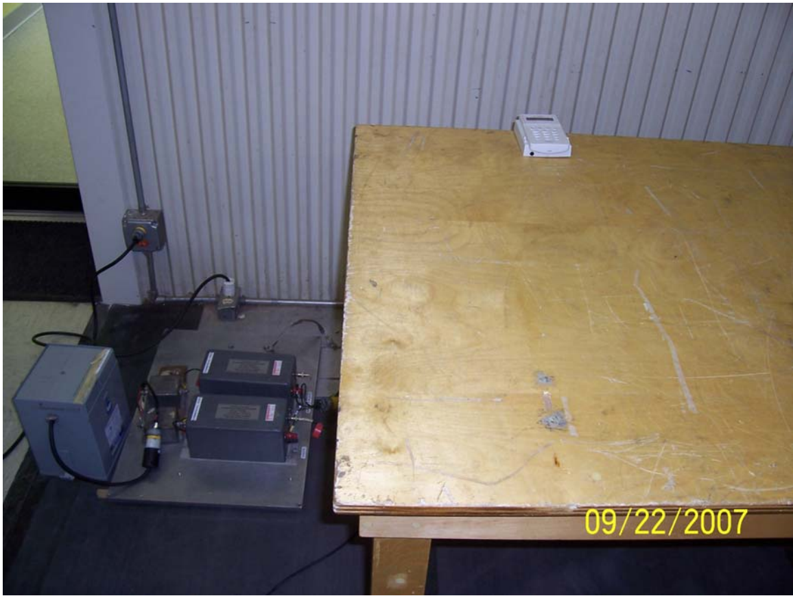
Conducted Emissions Test Setup