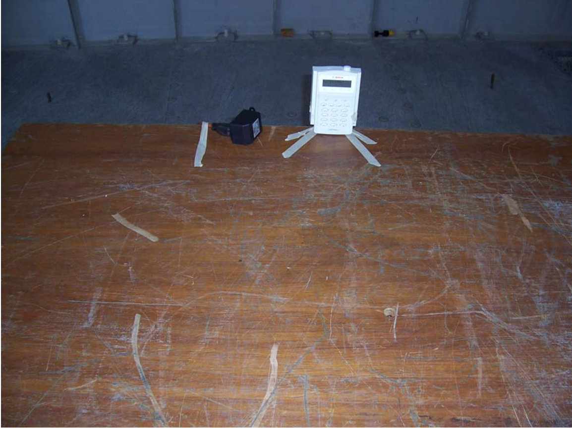
Radiated Emissions Test setup Y-Axis