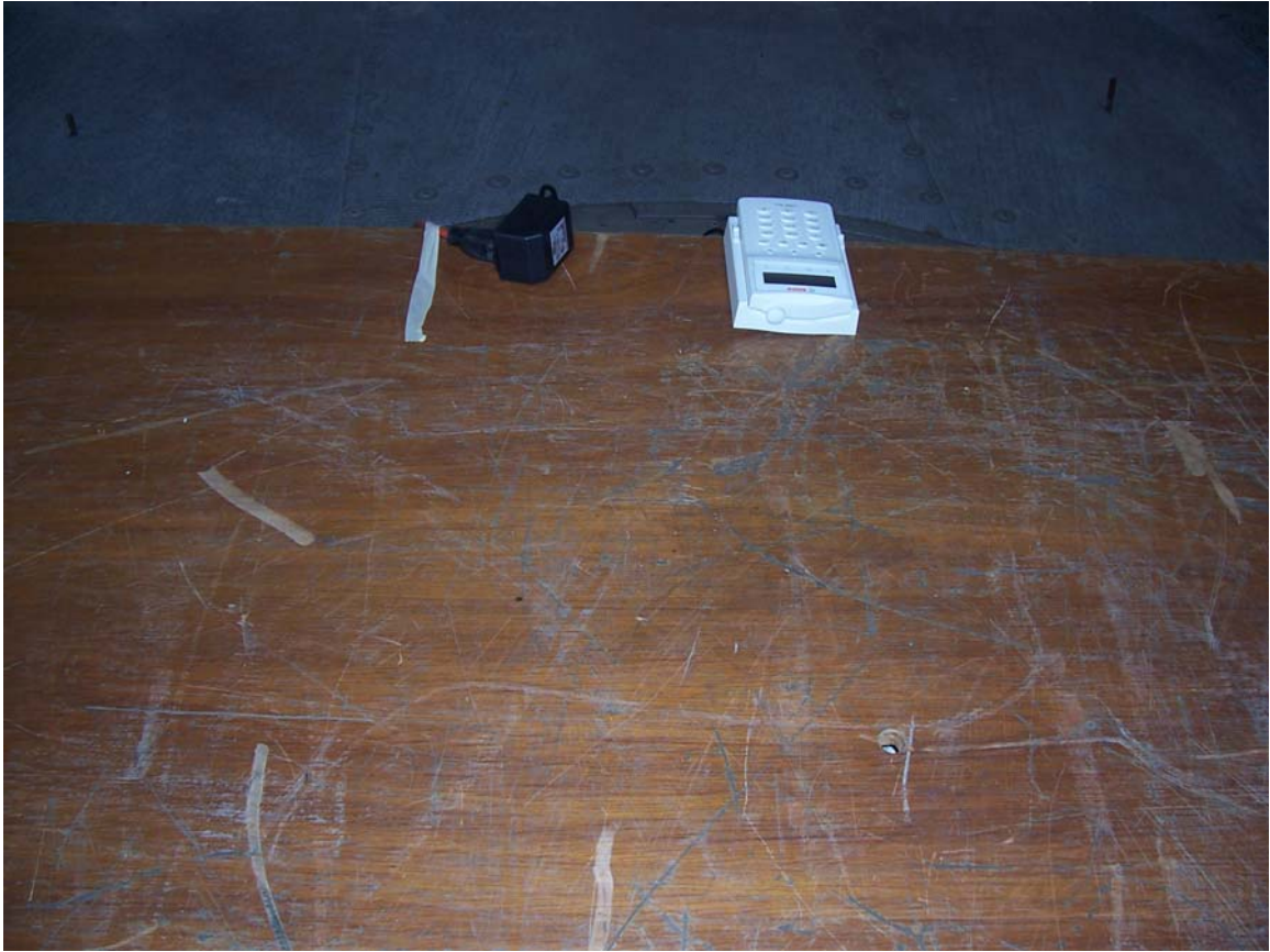
Radiated Emissions Test setup X-Axis