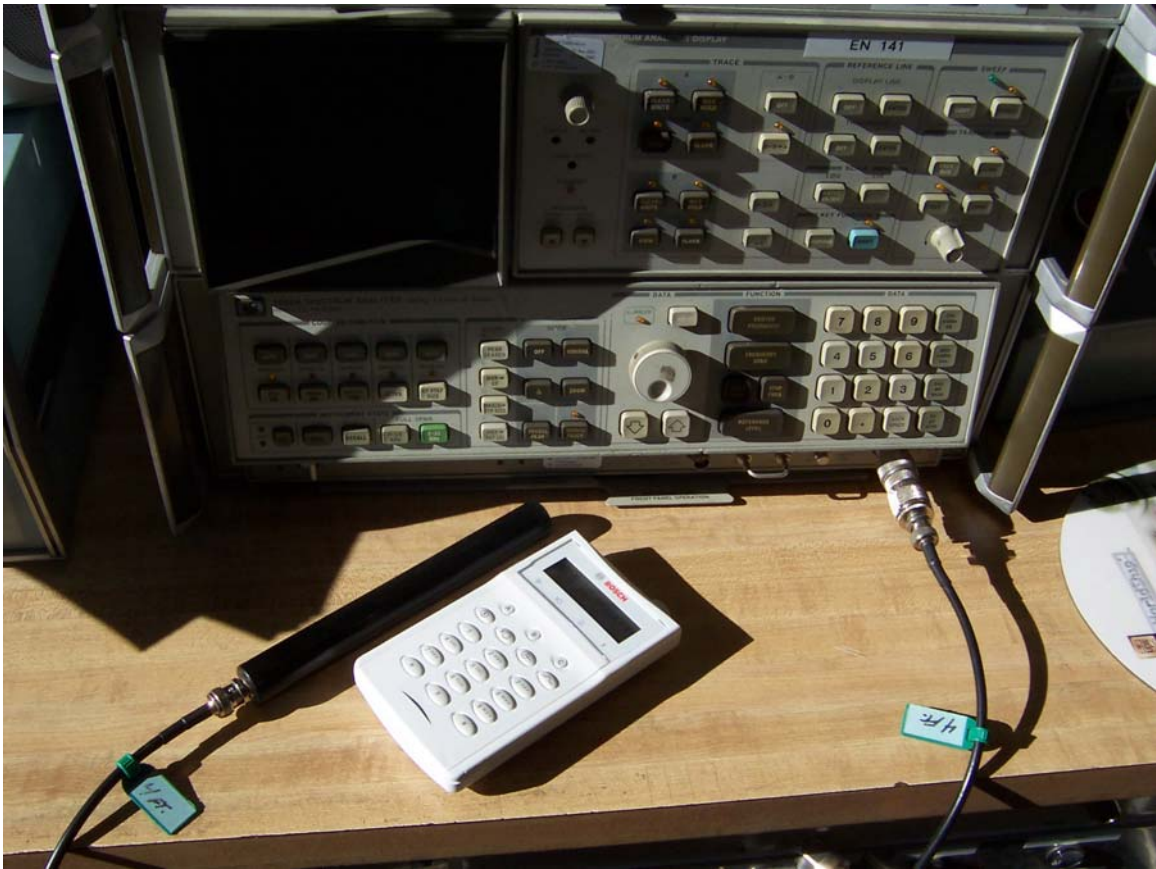
BW, Occupancy Time, 20 dB BW, Carrier frequency separation, Duty cycle Test Setup