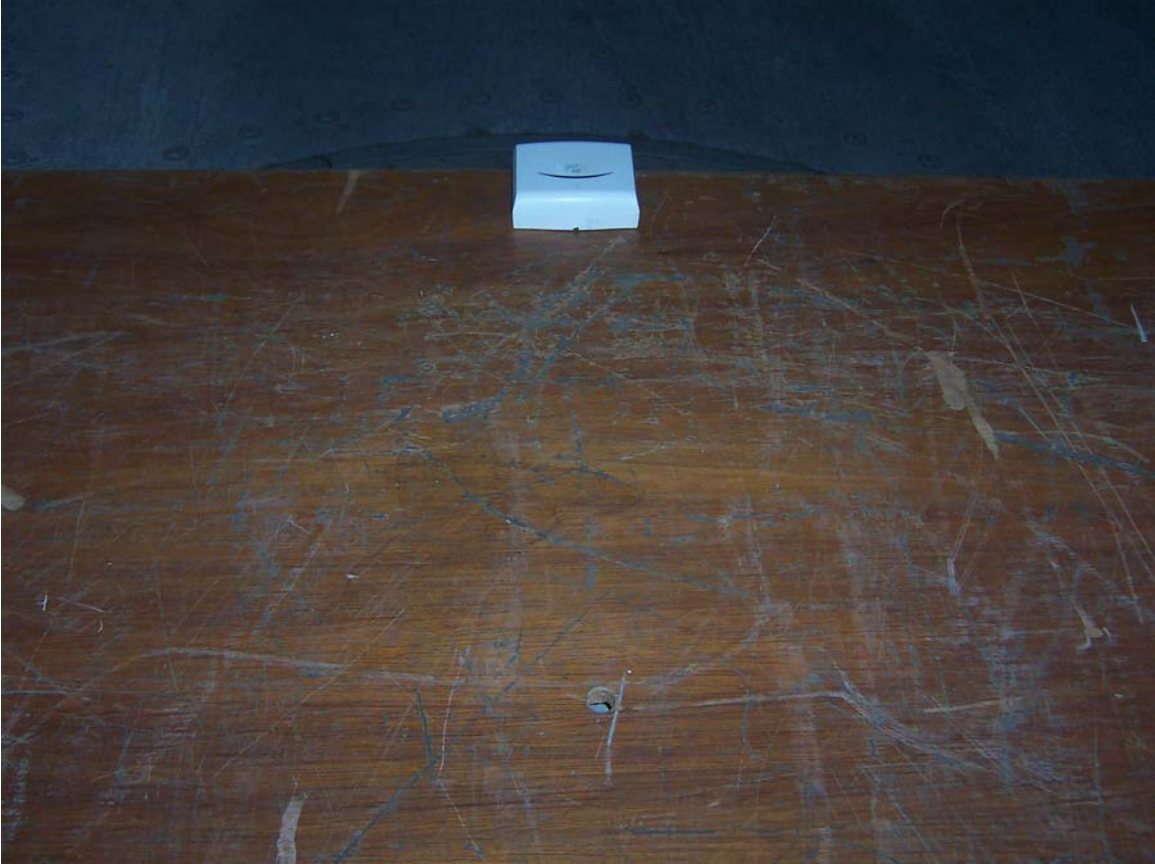
Radiated Emissions Test setup X-Axis