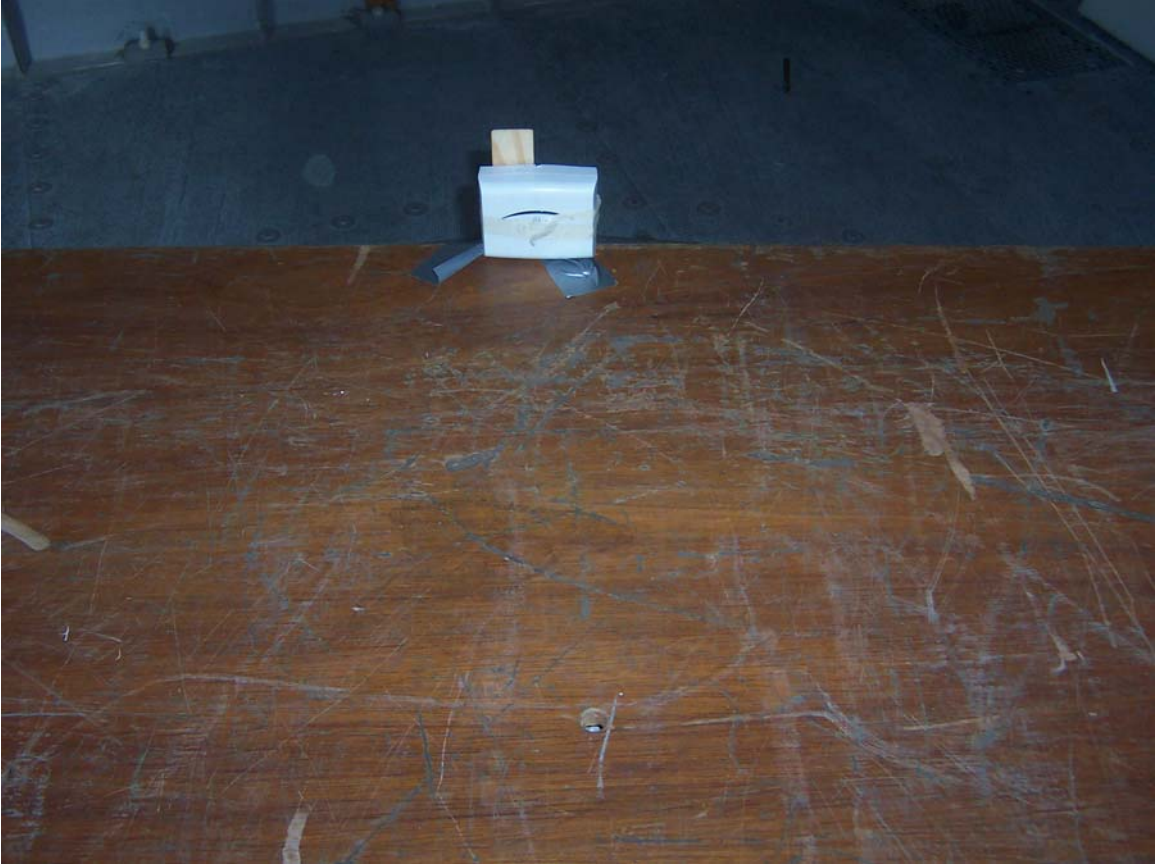
Radiated Emissions Test setup Z-Axis