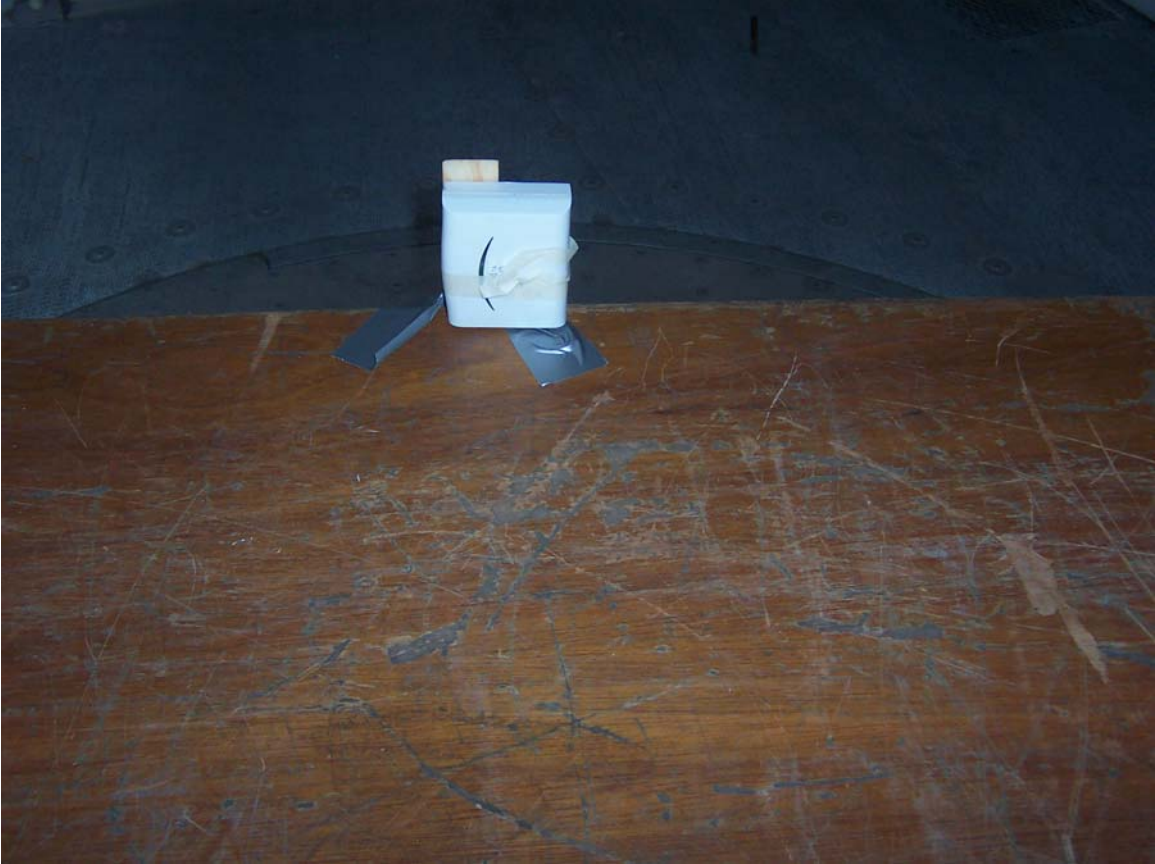
Radiated Emissions Test setup Y-Axis