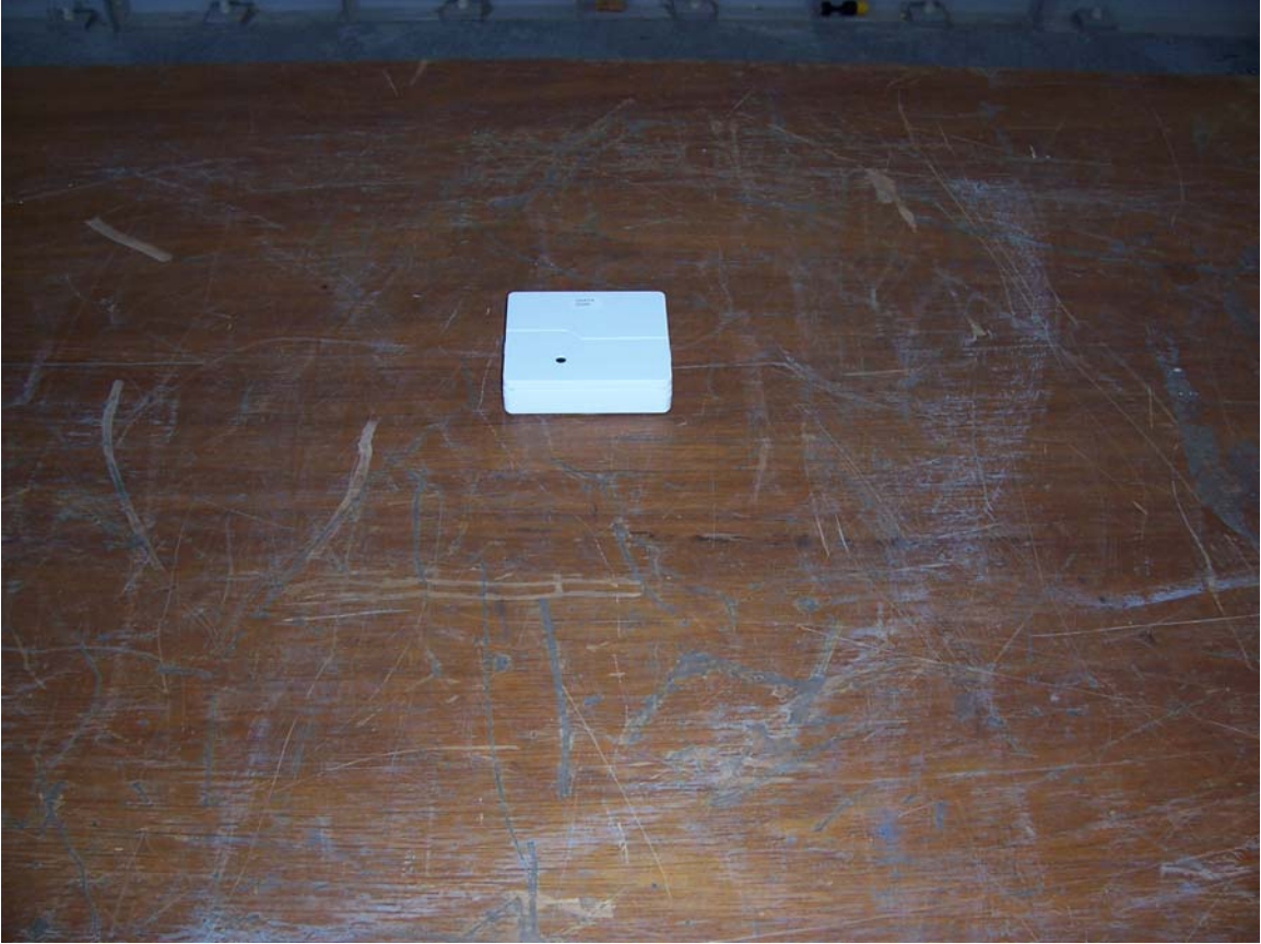
Radiated Emissions Test setup X-Axis