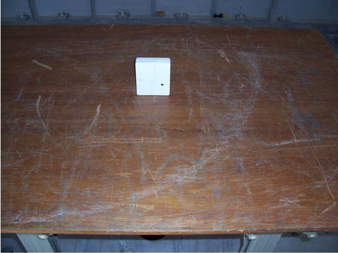
Radiated Emissions Test setup Z-Axis