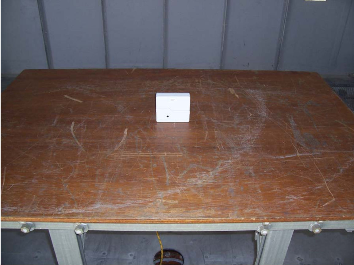
Radiated Emissions Test setup Y-Axis