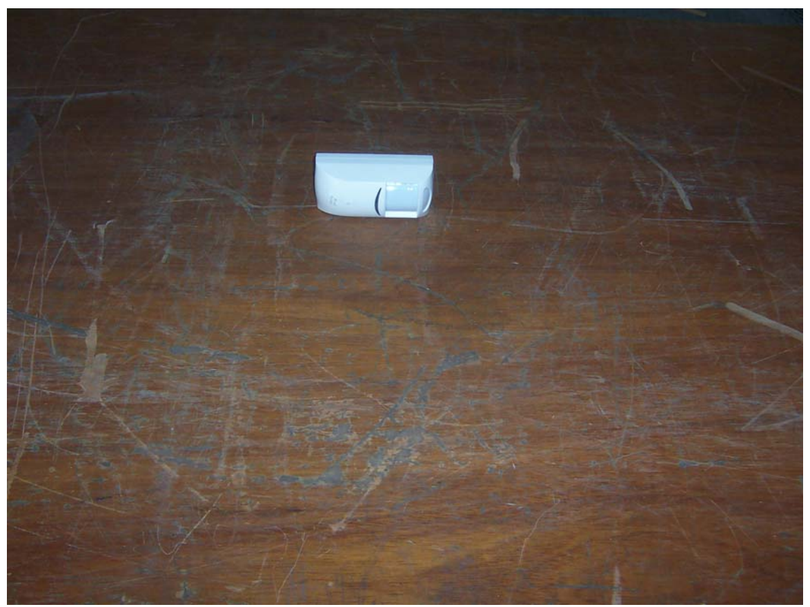
Radiated Emissions Test setup Y-Axis