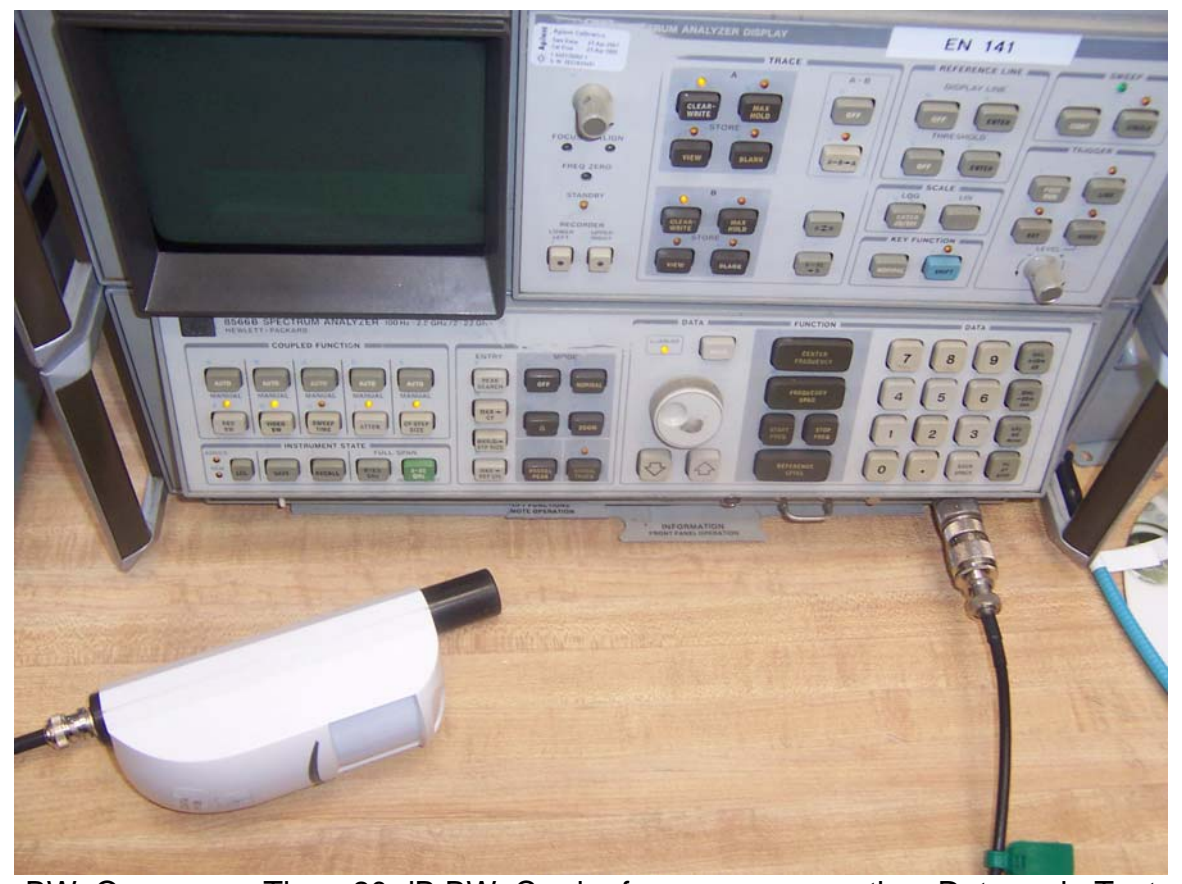
BW, Occupancy Time, 20 dB BW, Carrier frequency separation, Duty cycle Test Setup