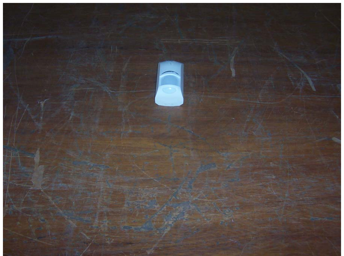
Radiated Emissions Test setup X-Axis