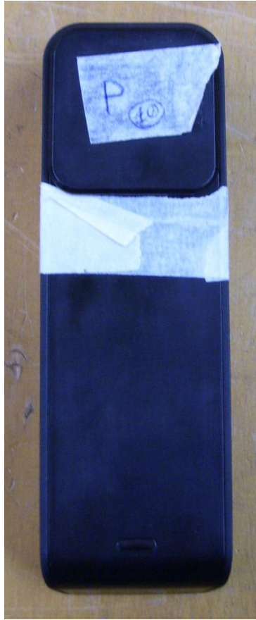
Figure 12: RFBT