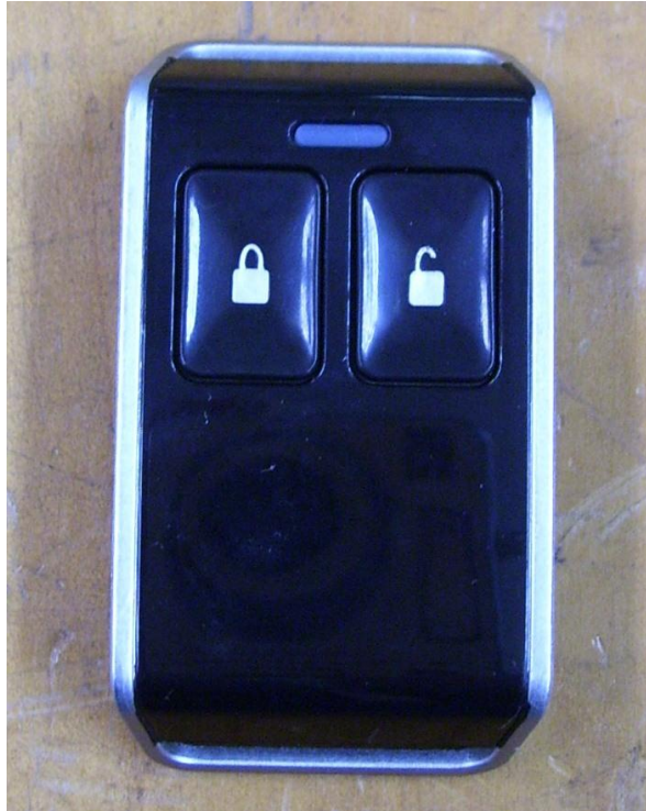
Figure 2: RFKF-TB