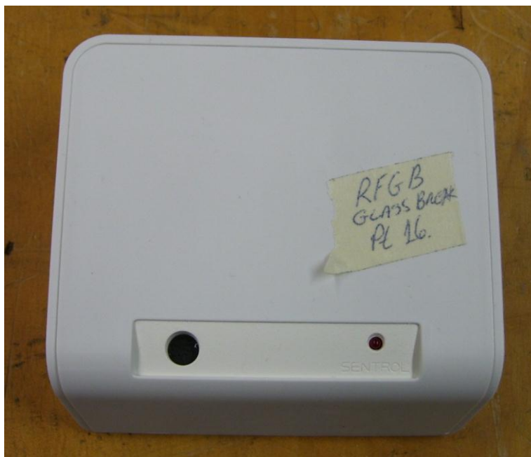
Figure 9: RFG B