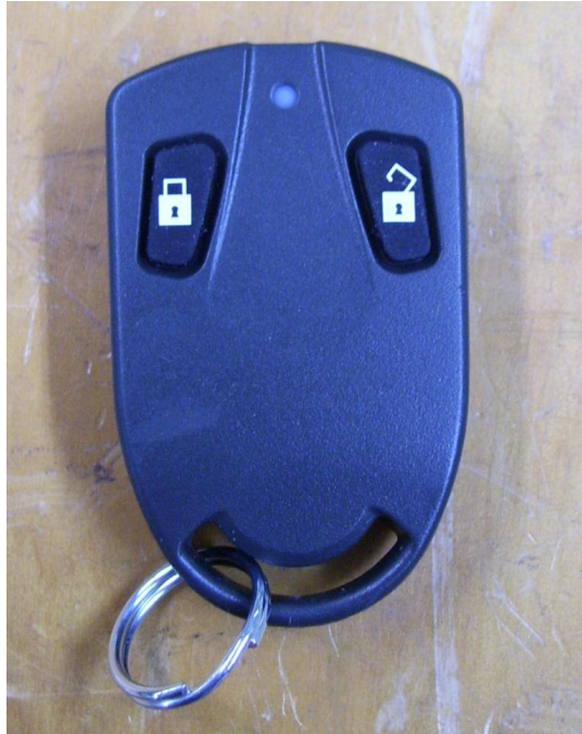
Figure 6: RFKF-A