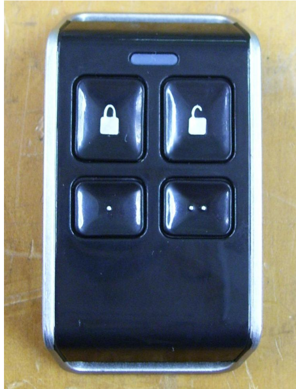
Figure 4: RFKF-FB