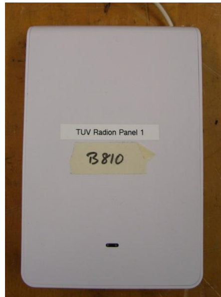
Figure 11: RFRP