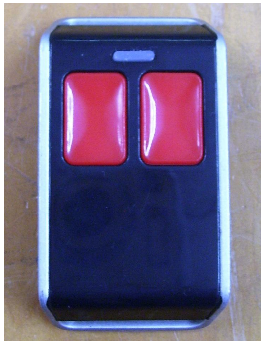
Figure 5: RFPB-TB