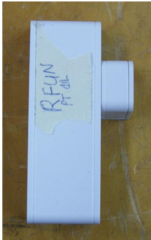
Figure 7: RFUN