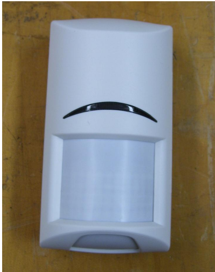
Figure 1: Model RFPR-12 This unit was used for all the transmitter testing as the circuitry is identical in each device, this model had the highest output power.