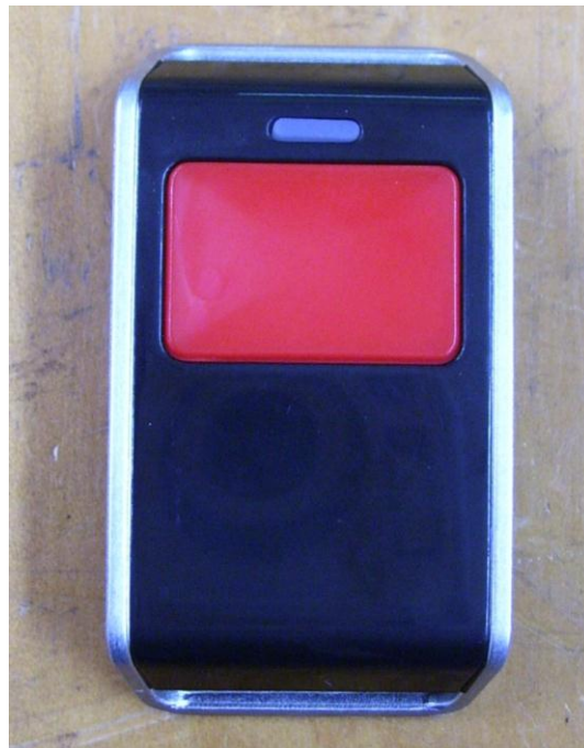
Figure 3: RFPB-SB