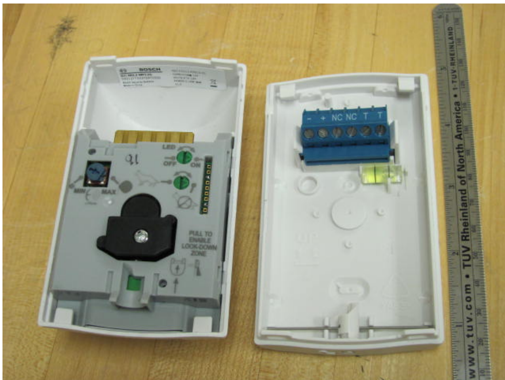
Figure 4 View with back cover off.