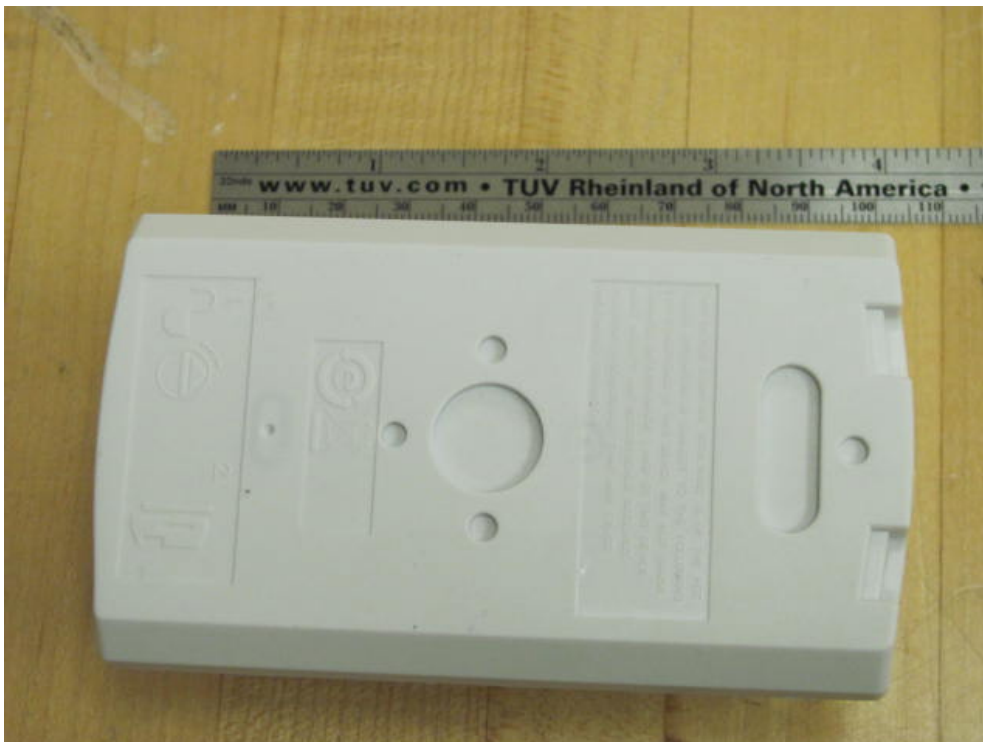
Figure 2: Rear View.