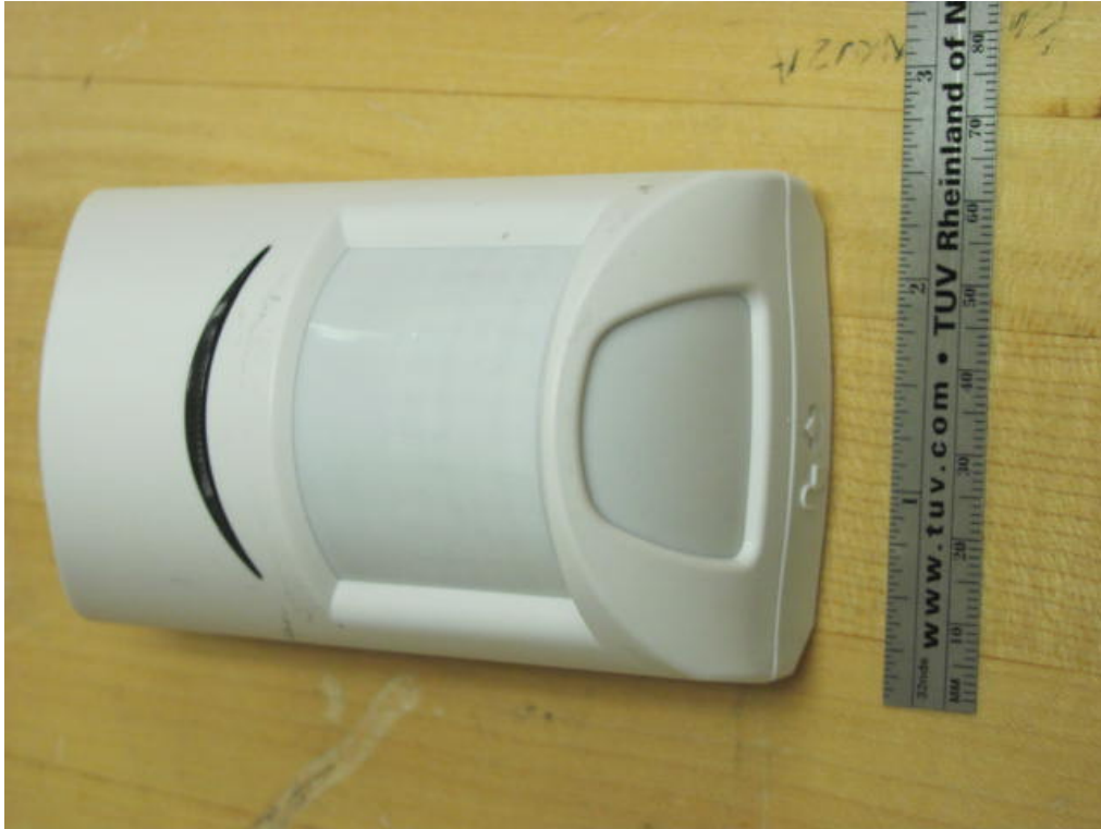
Figure 3: Bottom view