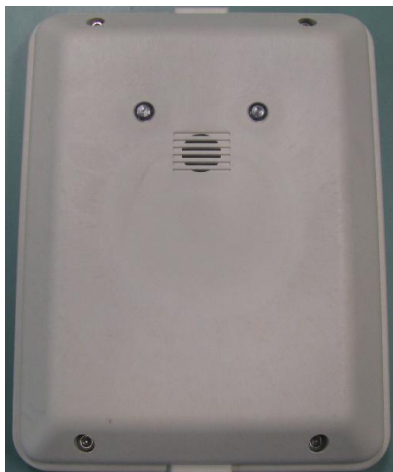
Enclosure top cover - inside view

- Picture below is just to show the location of the label, it may not contain the latest label artwork.