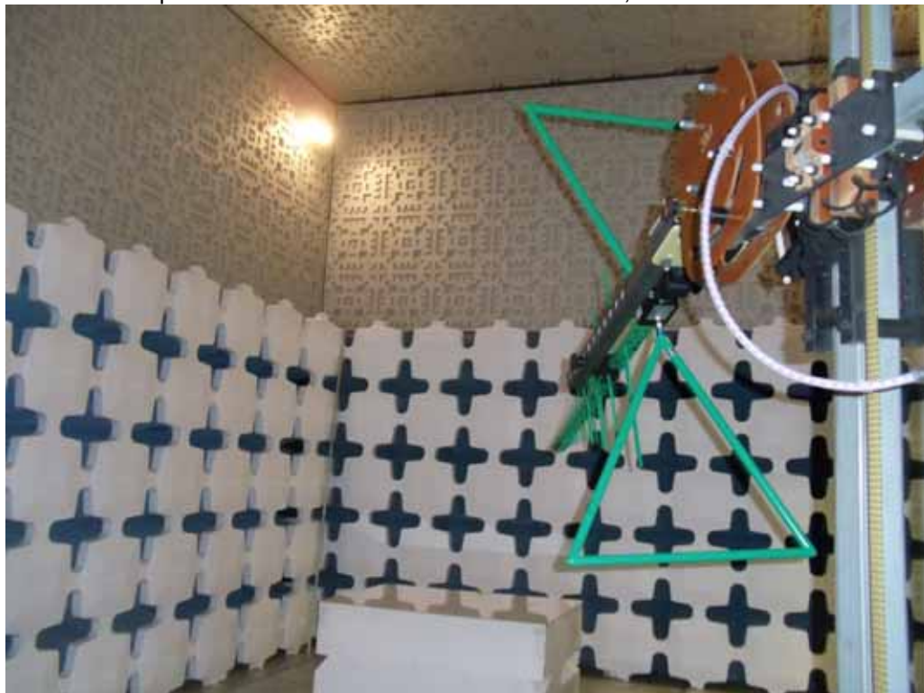
Test Setup for Radiated Emissions – 30MHz to 1GHz, Vertical Polarization