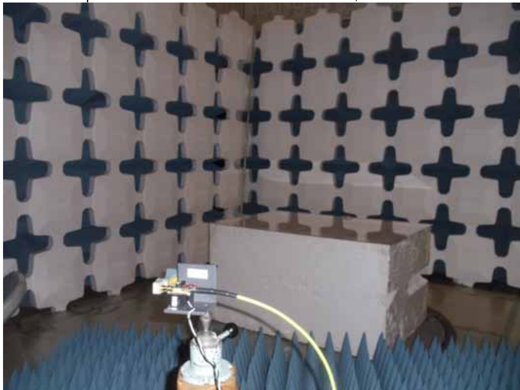
Test Setup for Radiated Emissions – 18GHz to 25GHz, Vertical Polarization