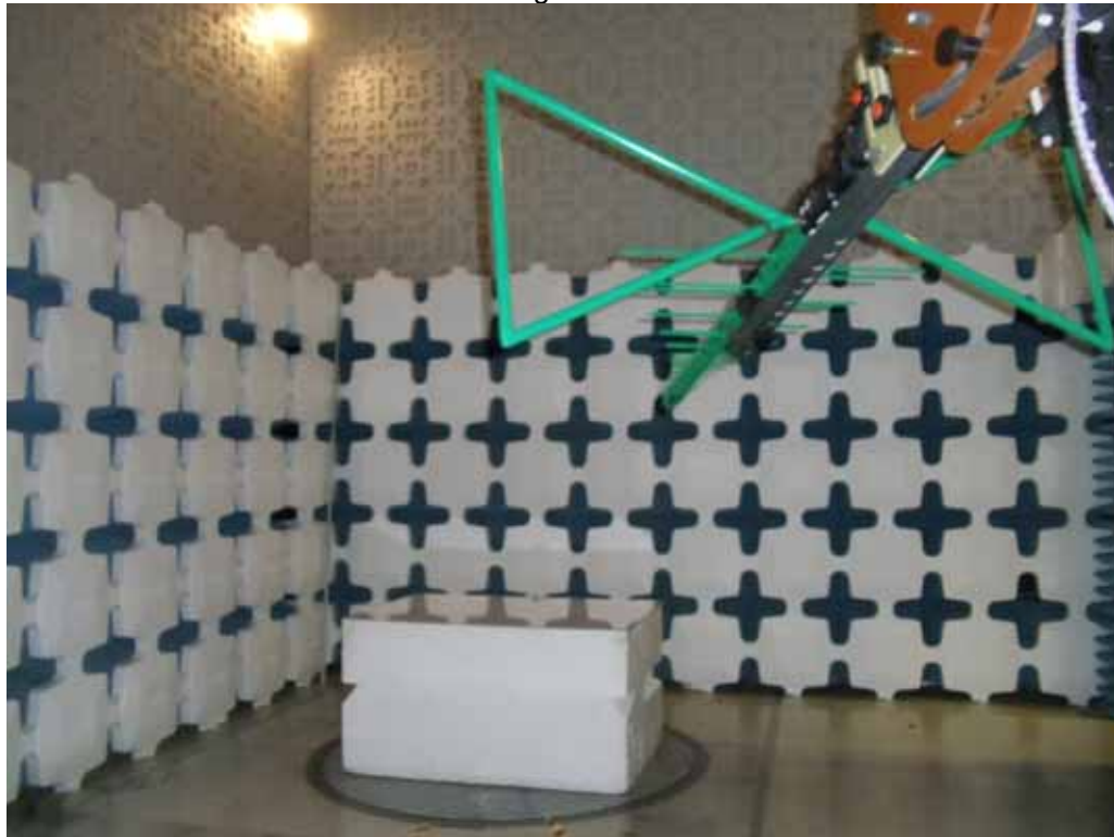
Test Setup for Radiated Emissions – 30MHz to 1GHz, Horizontal Polarization