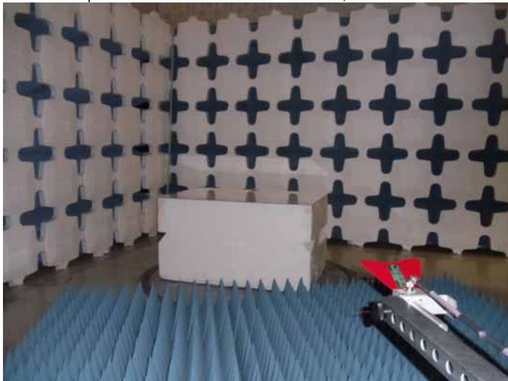
Test Setup for Radiated Emissions – 2GHz to 18GHz, Vertical Polarization