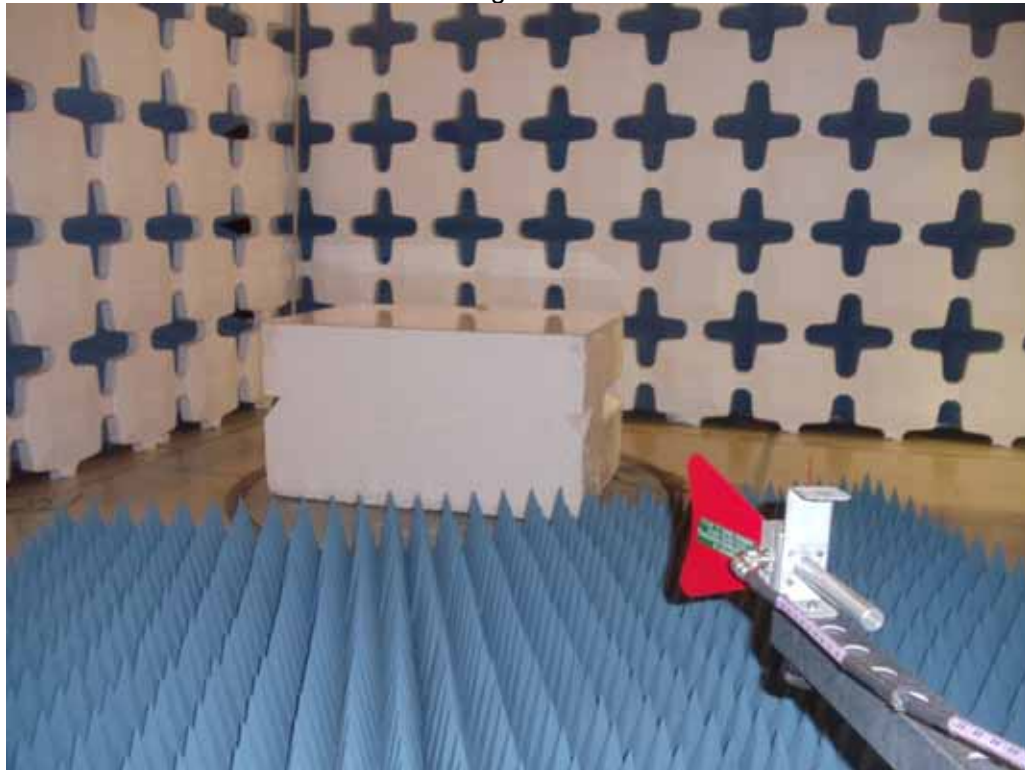
Test Setup for Radiated Emissions – 2GHz to 18GHz, Horizontal Polarization