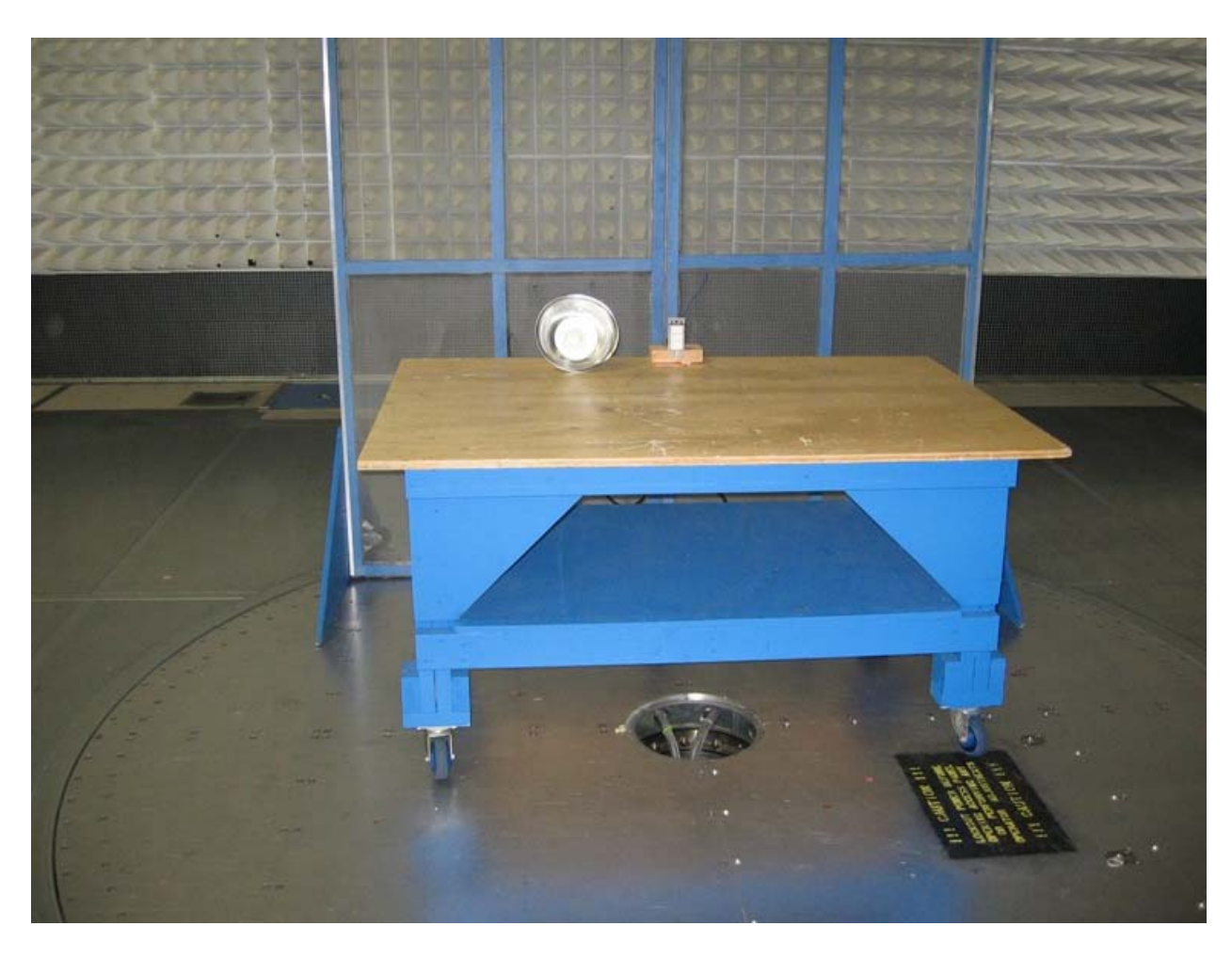
Conducted Emissions - Front View