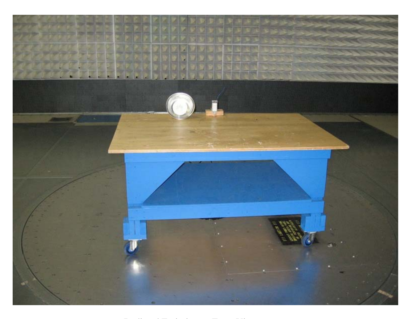
Radiated Emissions – Front View