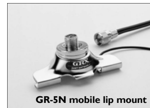
GR-5N mobile lip mount