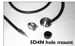
5D4N hole mount