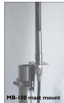
MB-100 mast mount