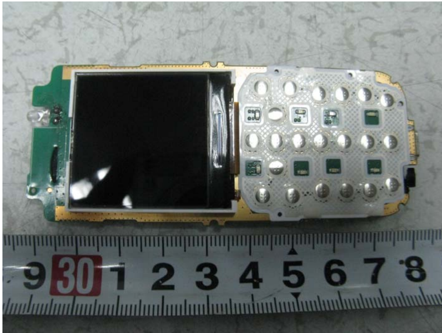
EUT – Main Board Top View