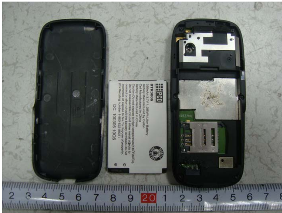
EUT – Cover off View