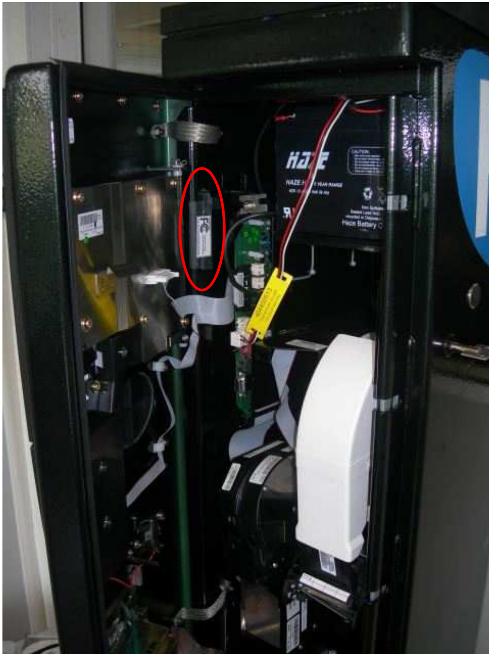
POSITION OF THE FCC ID