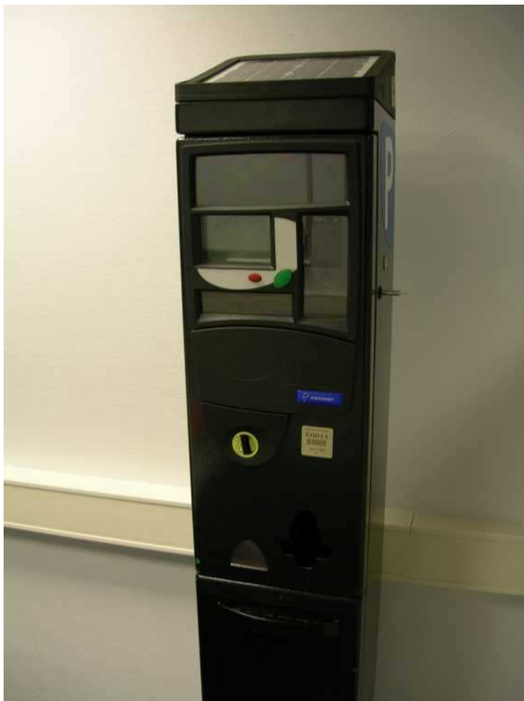
STRADA RAPIDE WiFi