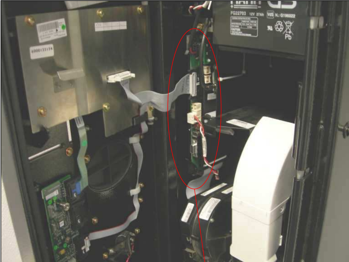
MOTHERBOARD + WiFi DAUGHTERBOARD