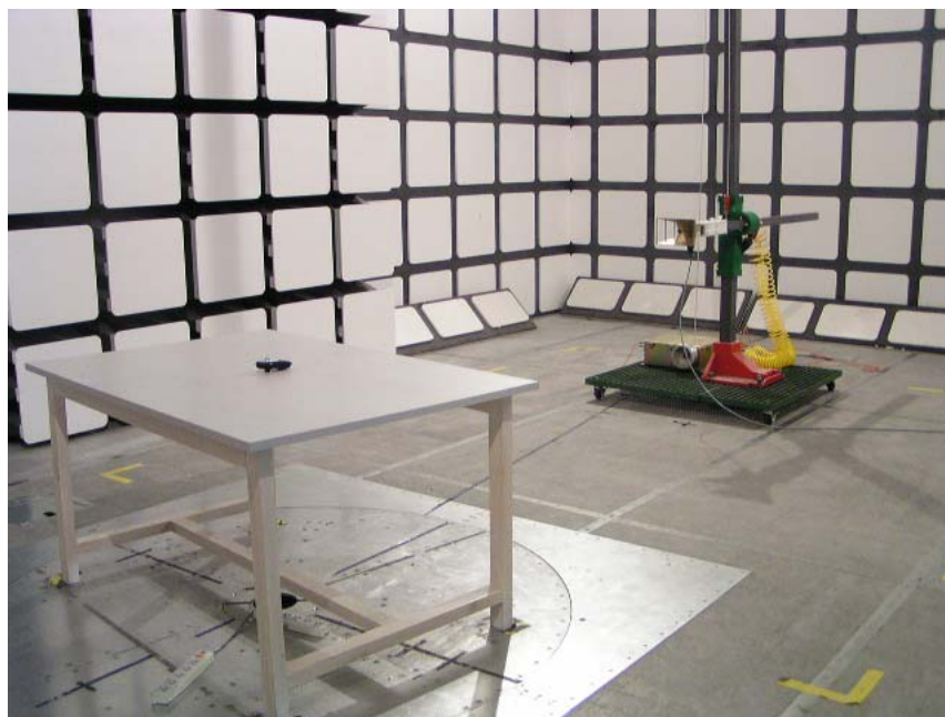
Above 1 GHz: Radiated Emission - Rear View