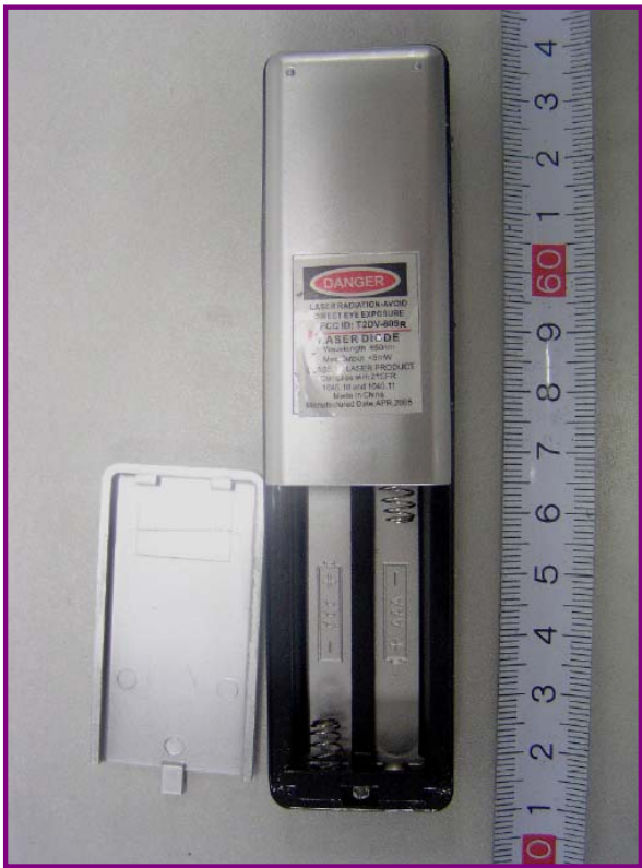
EUT – Cover off View