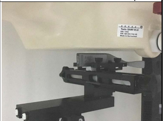
USB Vertical Back with 0.5 cm Gap