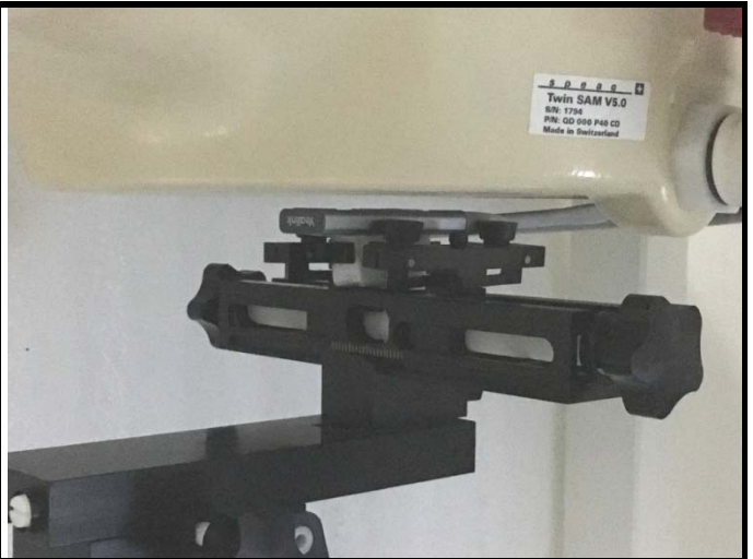
USB Horizontal Down with 0.5cm Gap