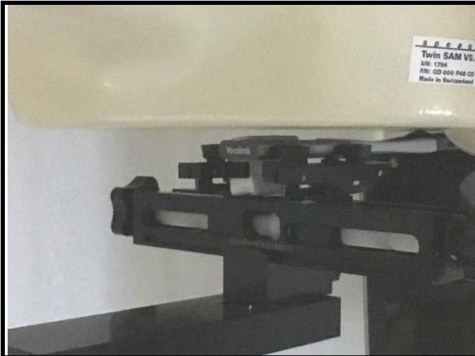
USB Horizontal Up with 0.5cm Gap