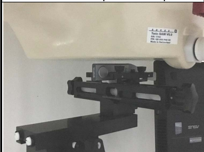
USB Vertical Front with 0.5 cm Gap