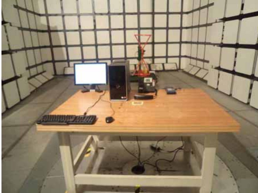
Radiated Emissions – Rear View (Below 1 GHz, for PoE)