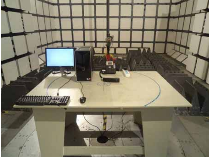
Radiated Emissions – Rear View (Above 1 GHz, for adapter 1)