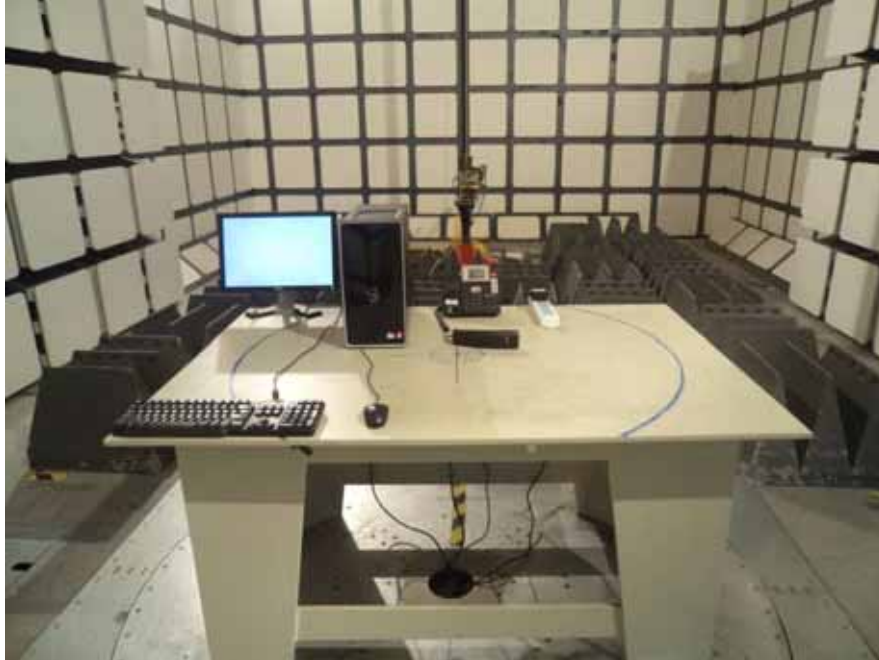
Radiated Emissions – Rear View (Above 1 GHz, for adapter 2)