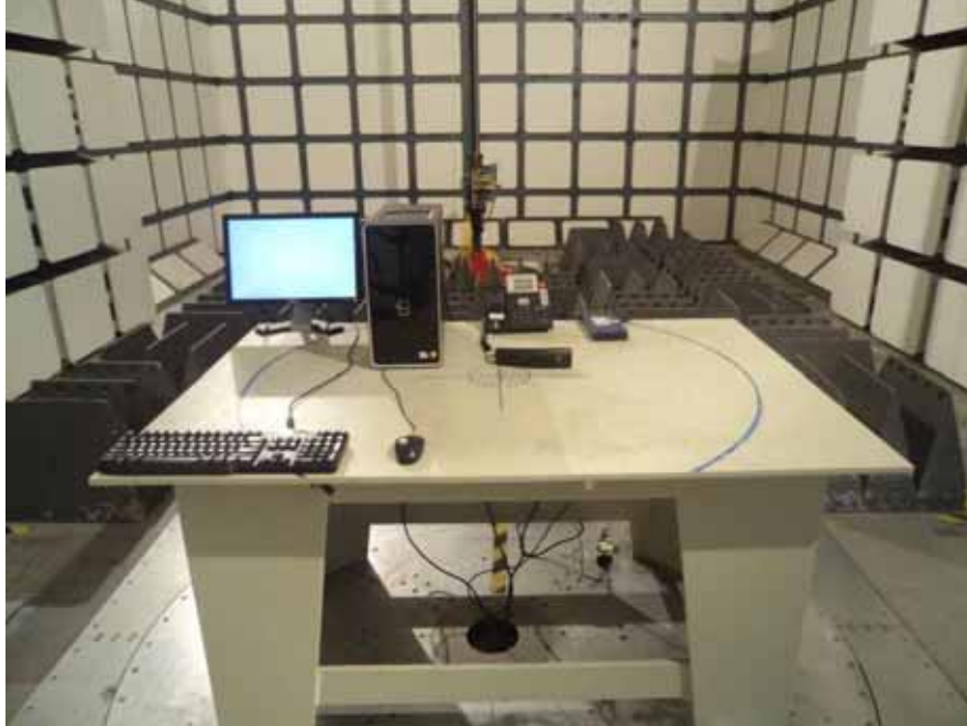
Radiated Emissions – Rear View (Above 1 GHz, for PoE)