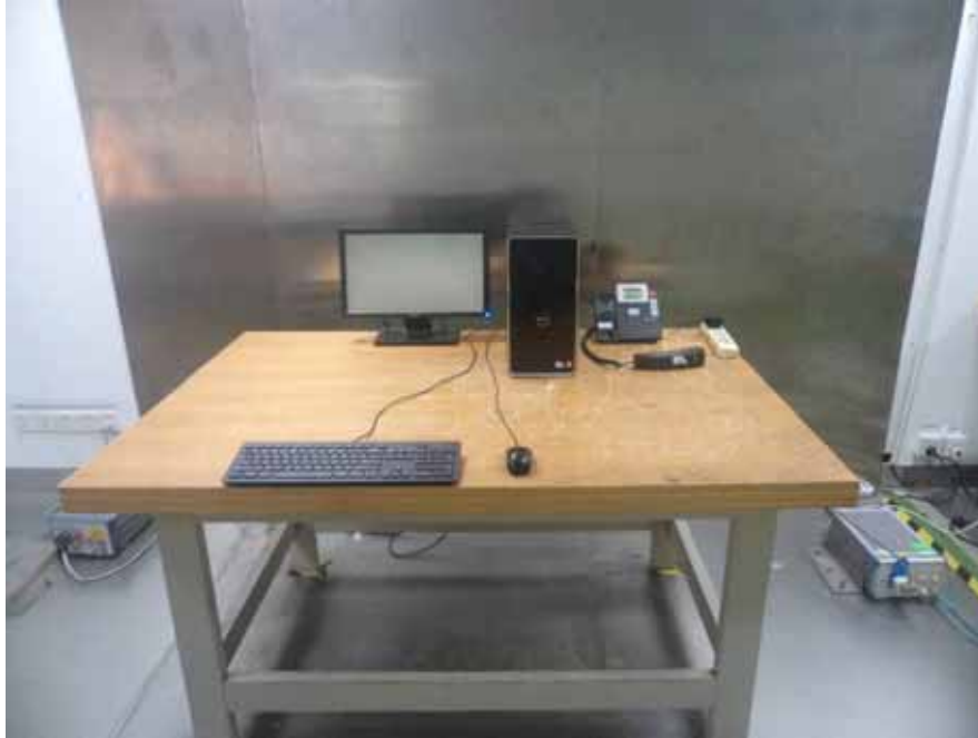
Conducted Emissions - Side View (for adapter 1)