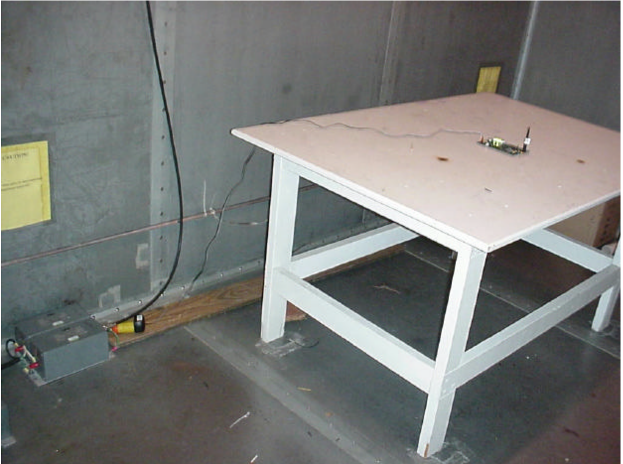
Photo represents worst case configuration