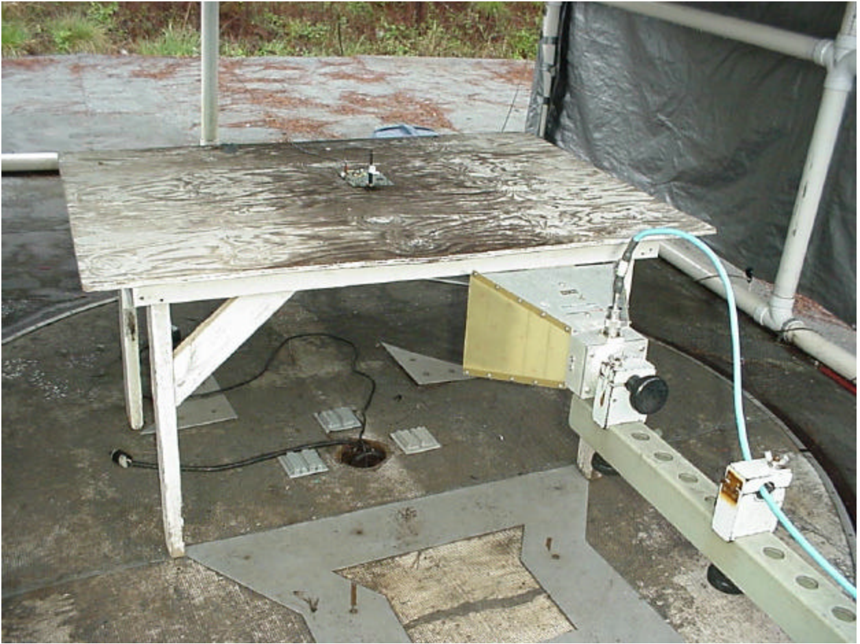
Photo represents worst case configuration