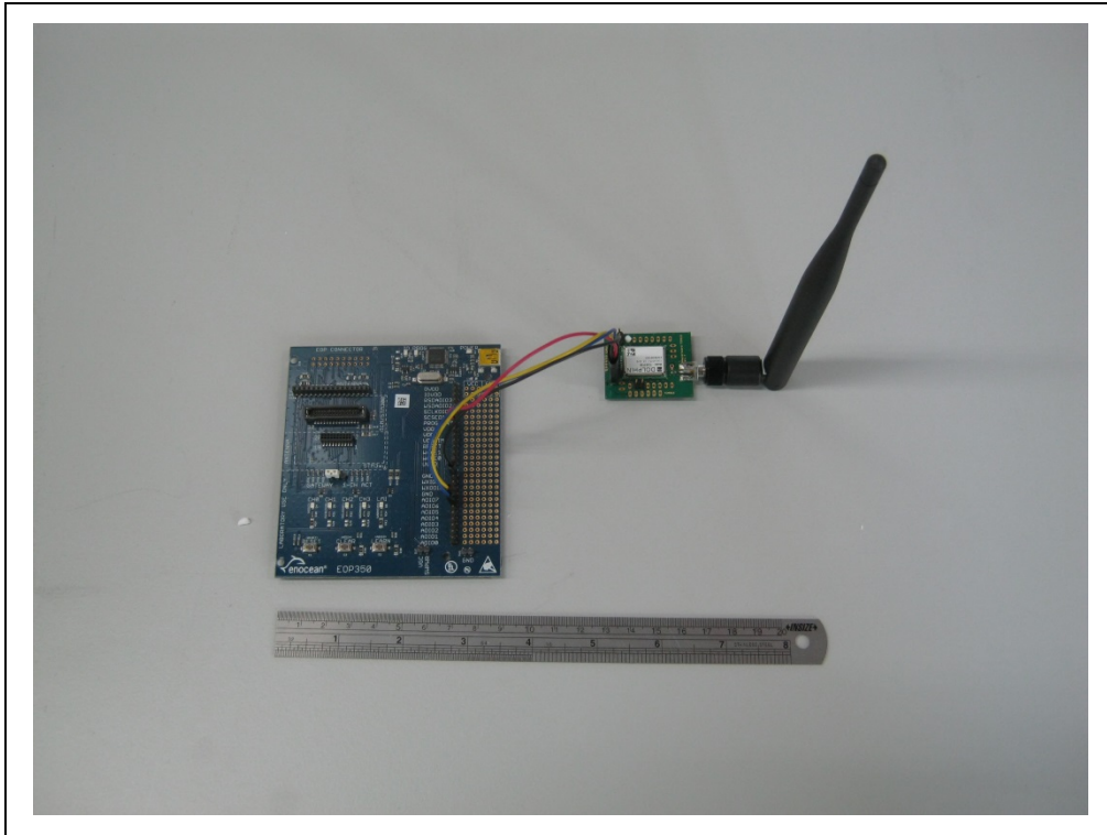
Photograph A3-1: Eval Board EOP 350, with EUT connected