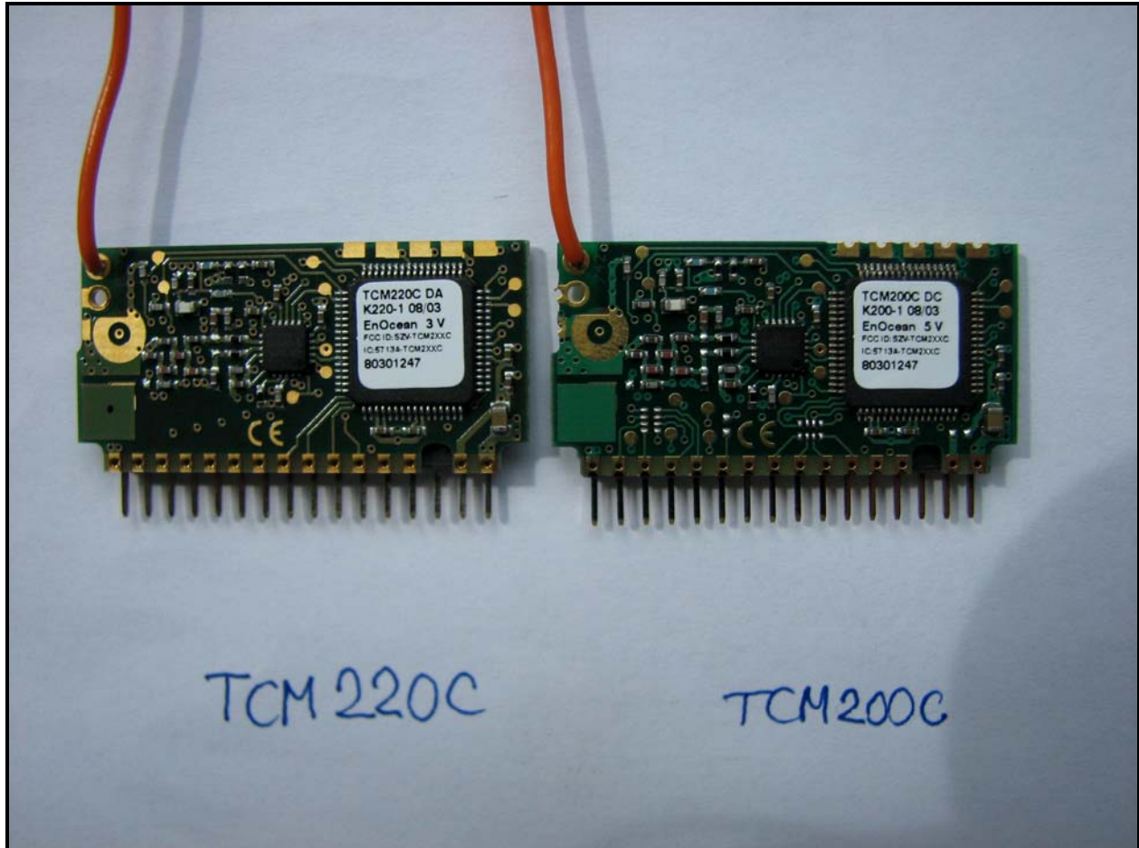
Photograph 5: Top View