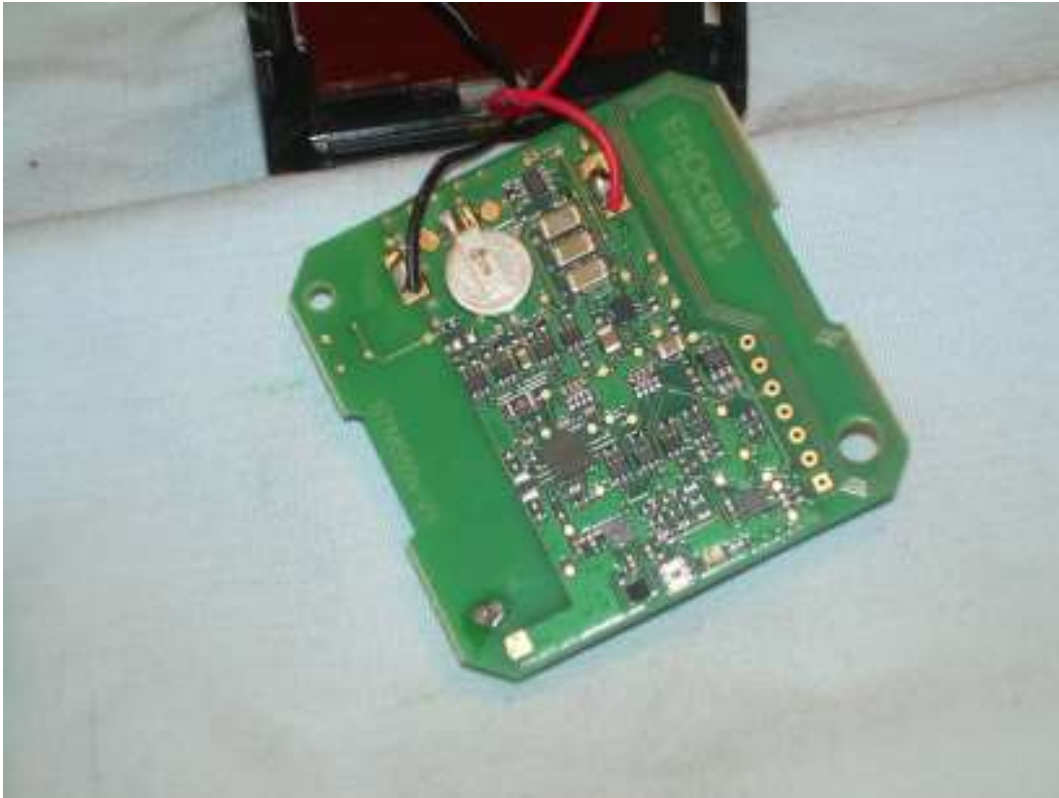
Photograph 2 – Back View of the Device