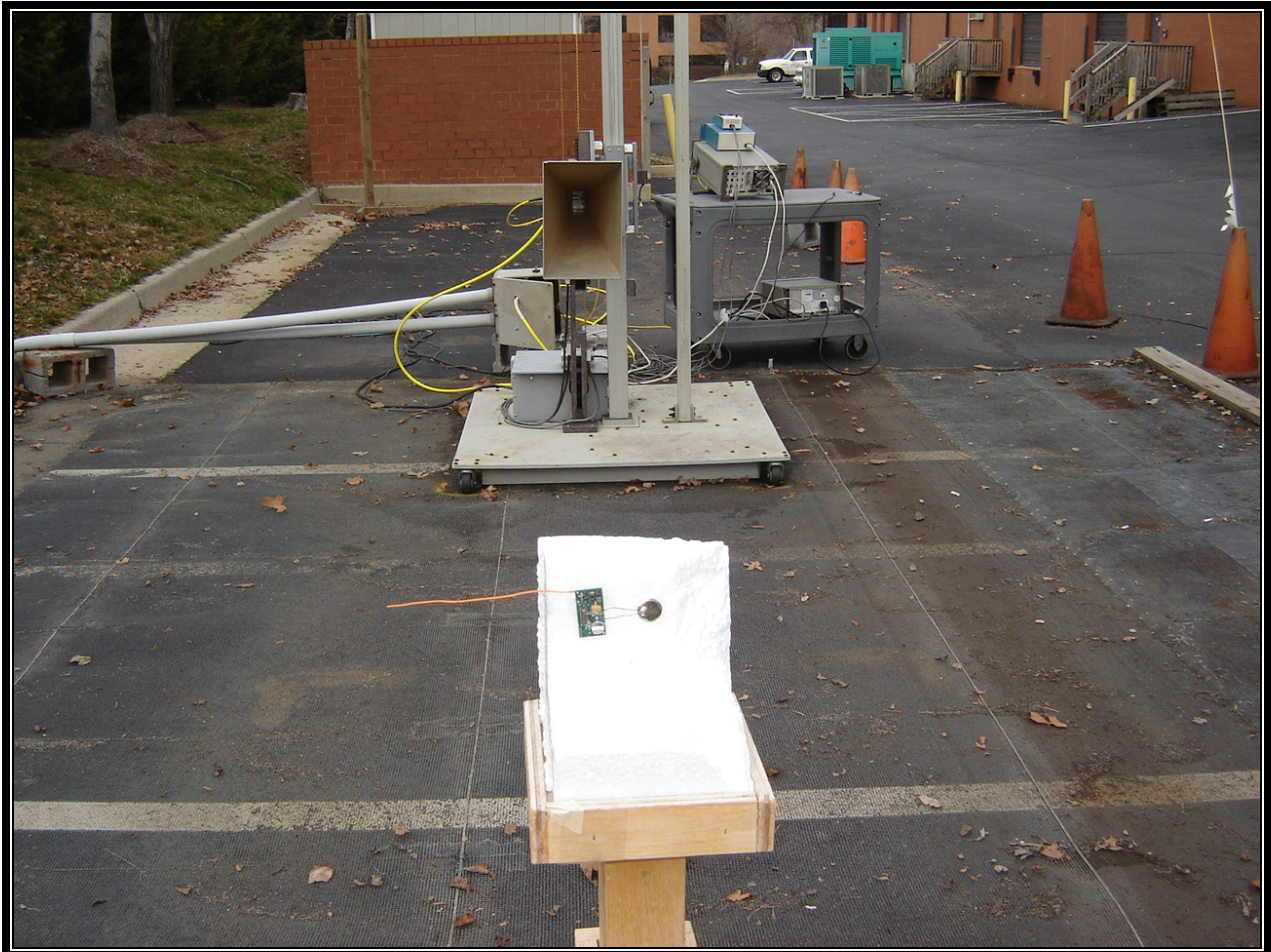
Photograph 2: Radiated Emissions